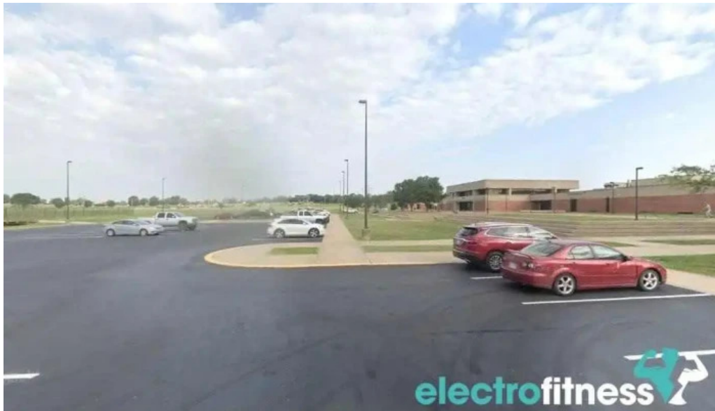
Allen community college gym iola