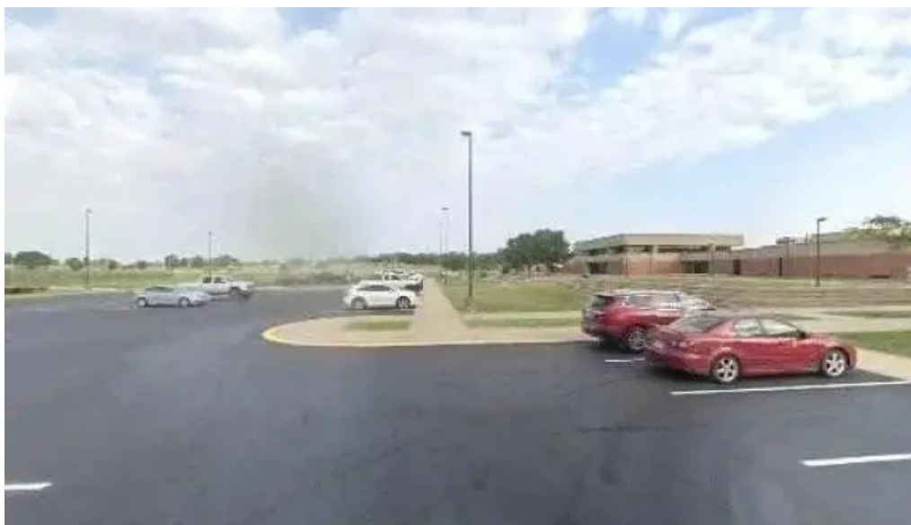
Allen community college gym all