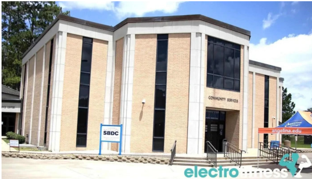
Angelina college community services css lufkin