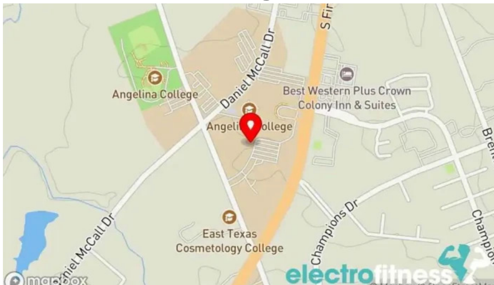
Angelina college community services css map