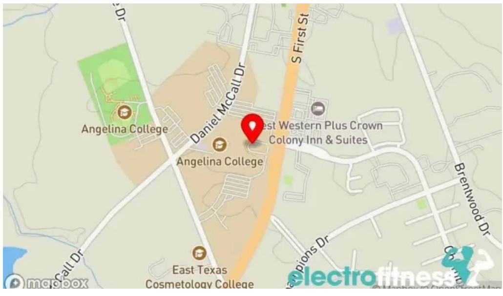
Angelina college map