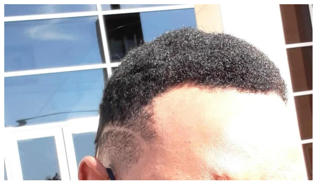
Angelina college community college