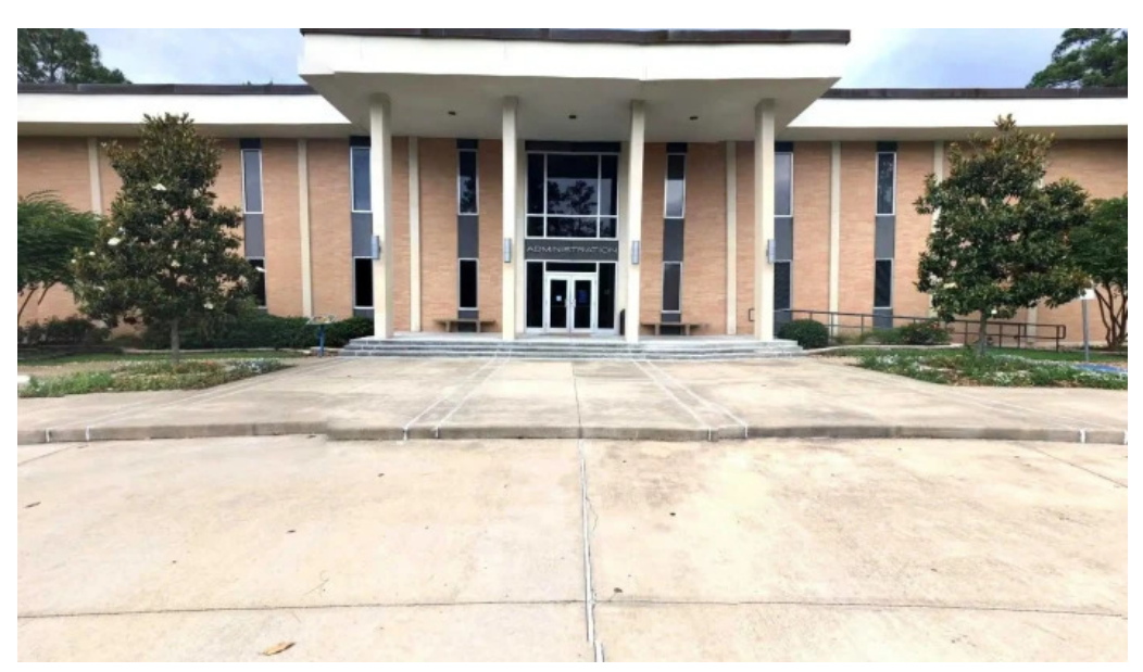
Angelina college street view 360deg