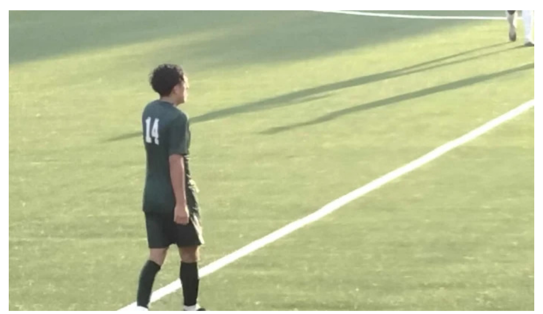
Angelina college schedule