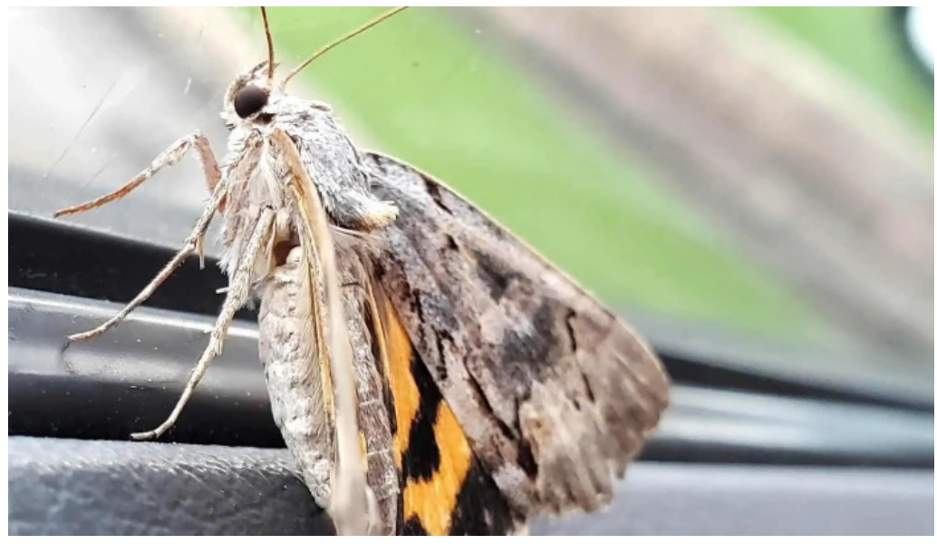
Angelina college lufkin