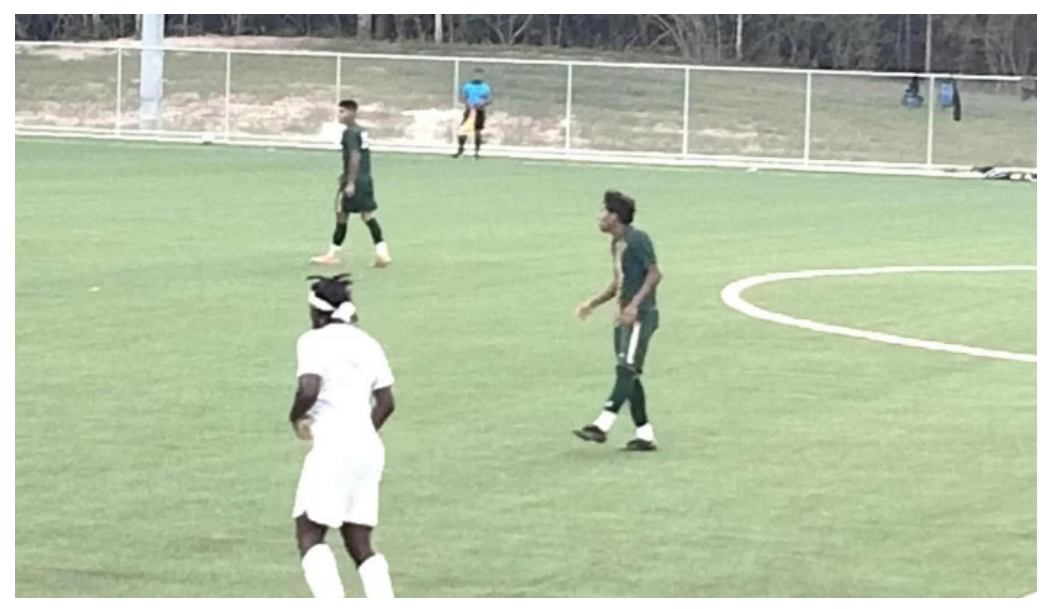
Angelina college number