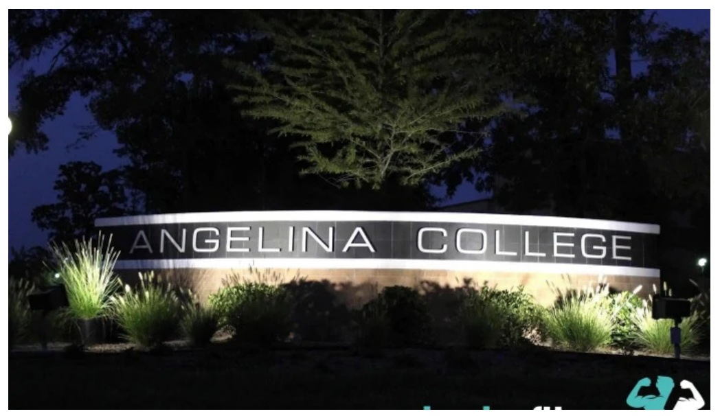
Angelina college all