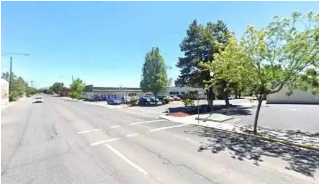
Klamath dance exercise street view 360deg