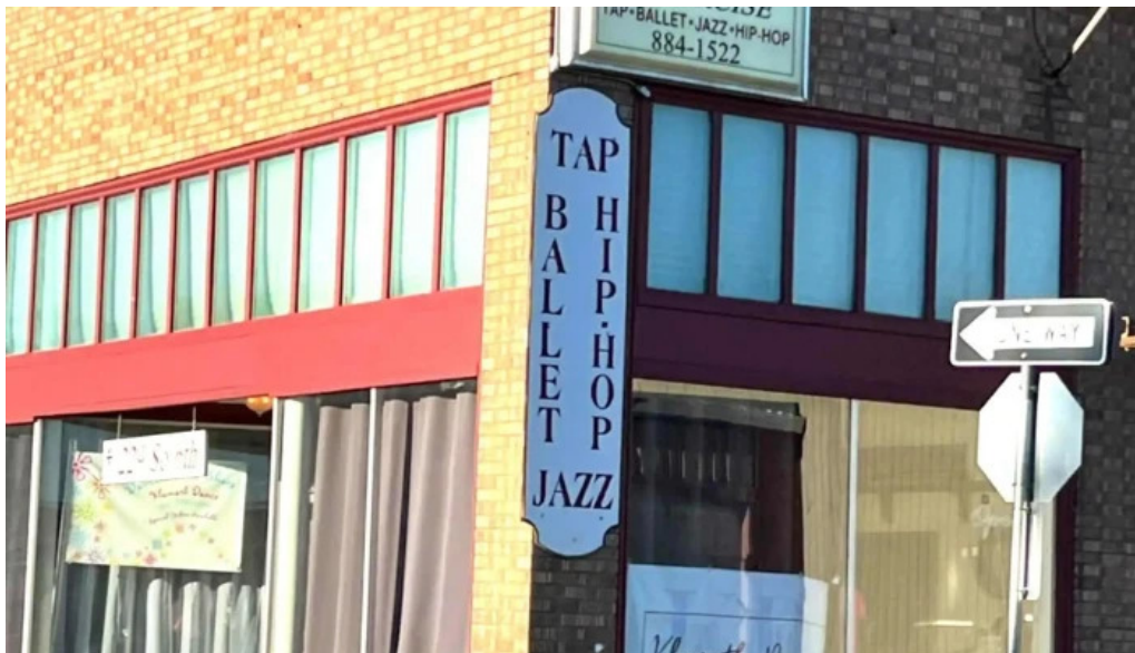
Klamath dance exercise all