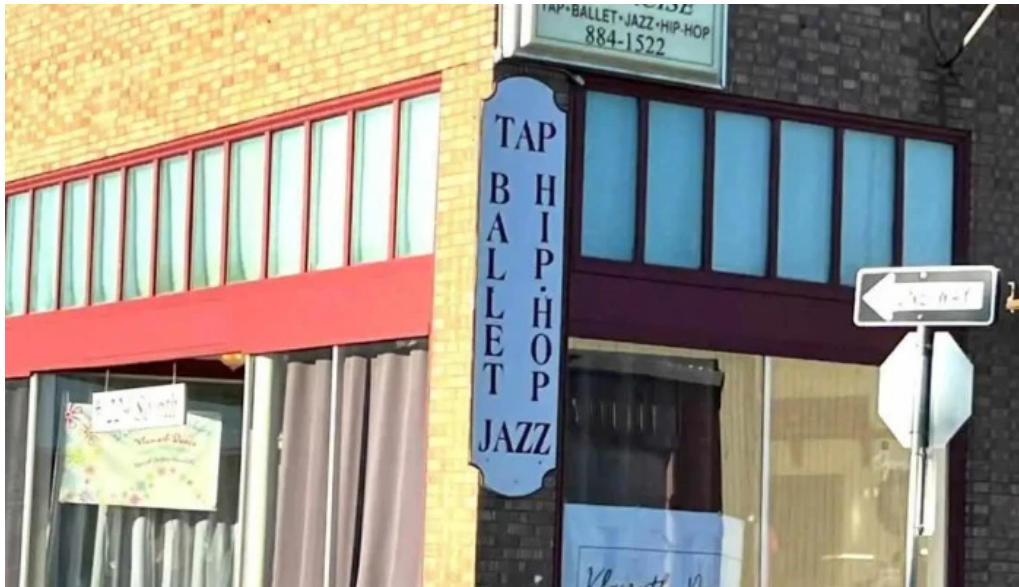
Klamath dance exercise klamath falls