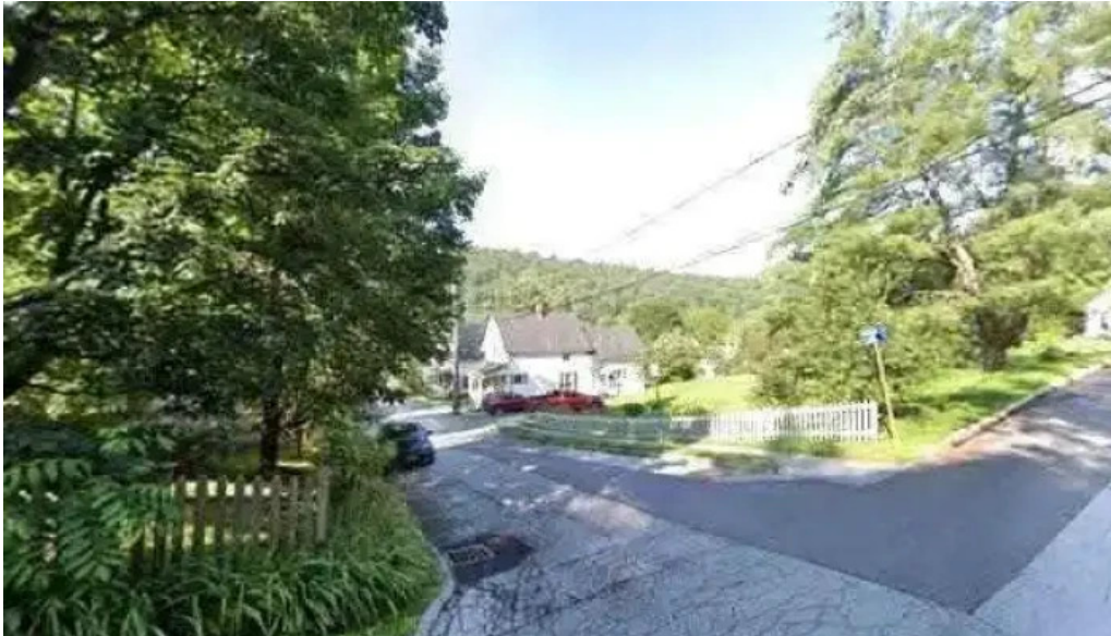
Contemporary dance and fitness studio street view 360deg