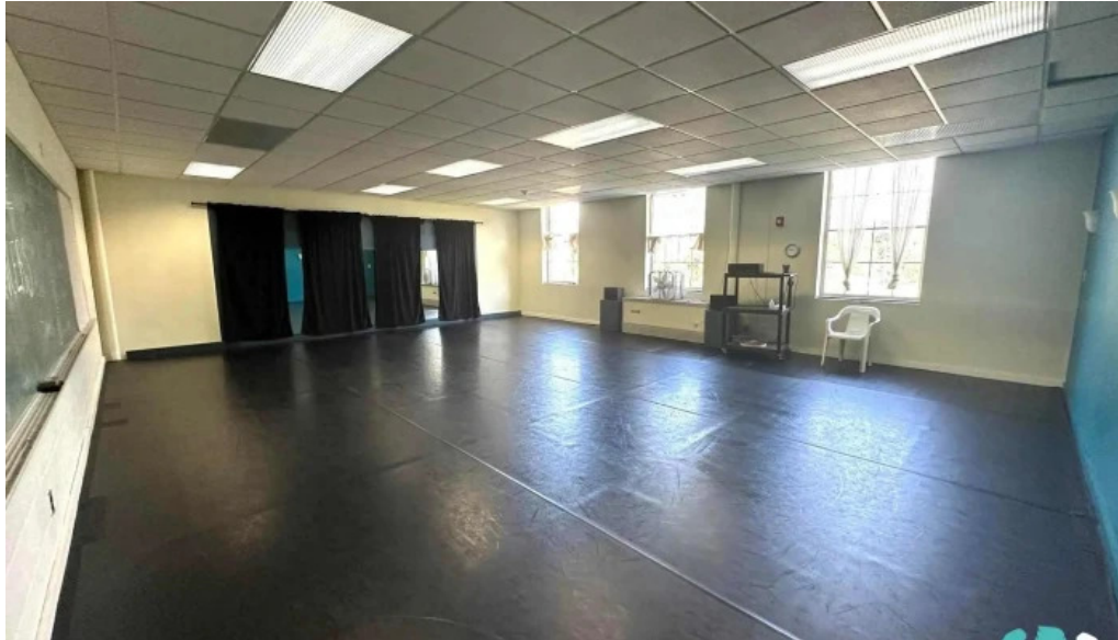
Contemporary dance and fitness studio all