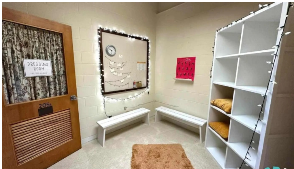
Contemporary dance and fitness studio by owner