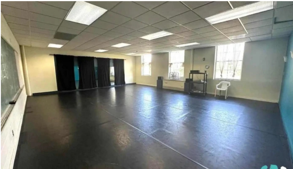
Contemporary dance and fitness studio montpelier