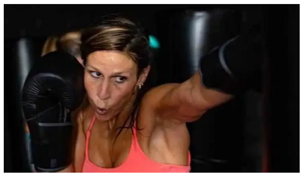
Conquer kickboxing ada