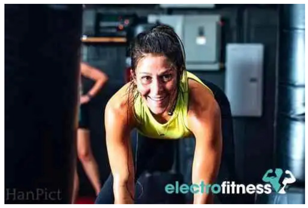
Conquer kickboxing gym