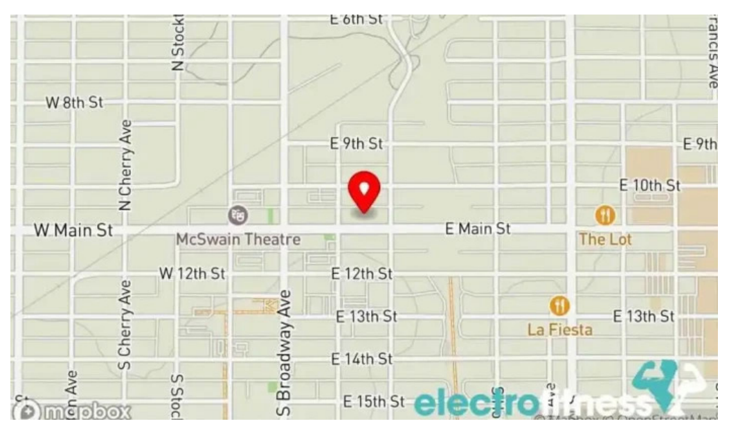
Conquer kickboxing map