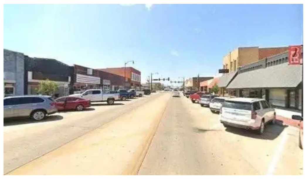
Conquer kickboxing street view 360deg