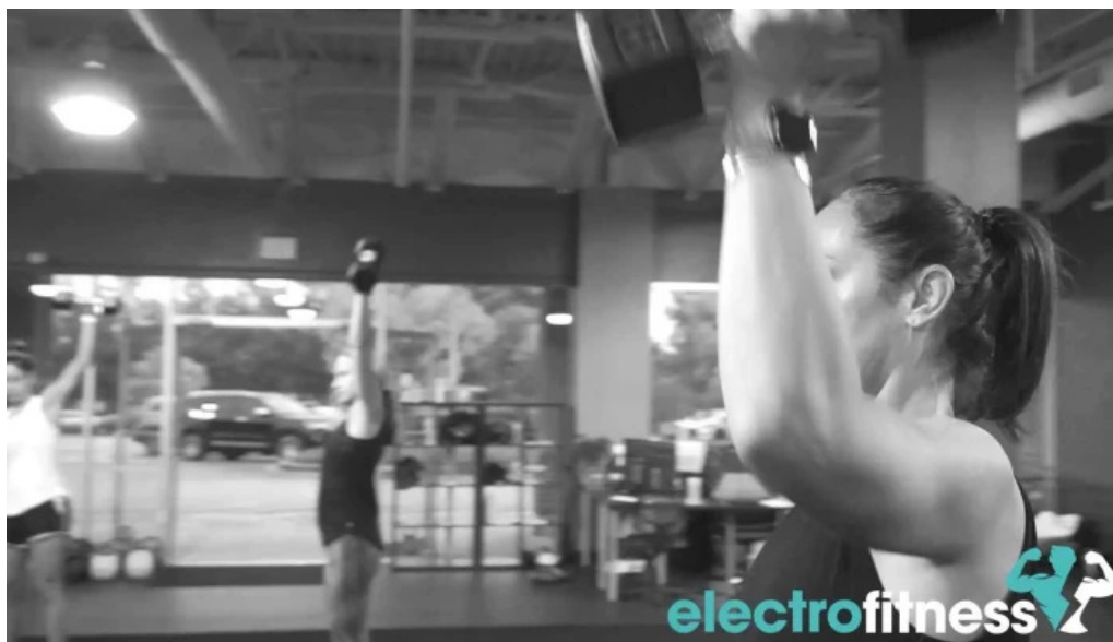
Clockworks fitness gym