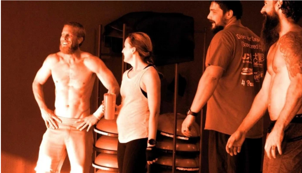
Clockworks fitness by owner