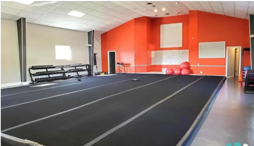
Clockworks fitness anderson