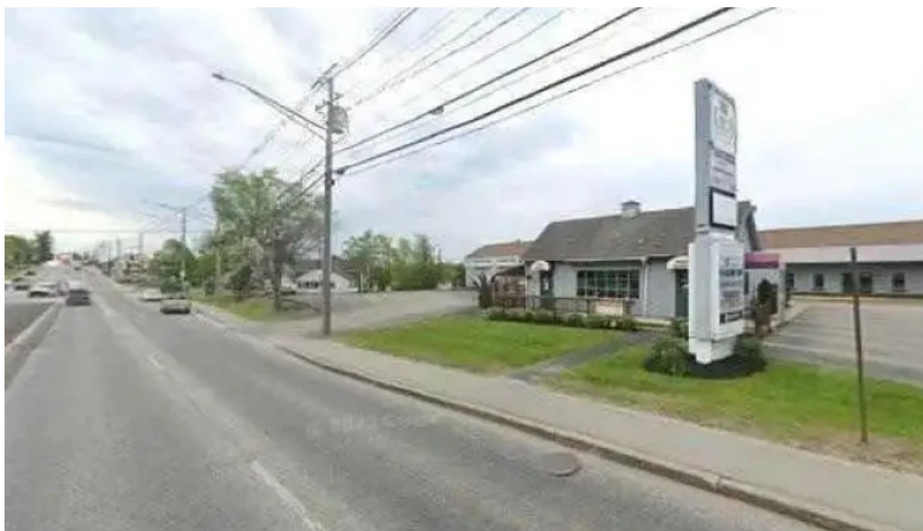
Pro edge fitness all