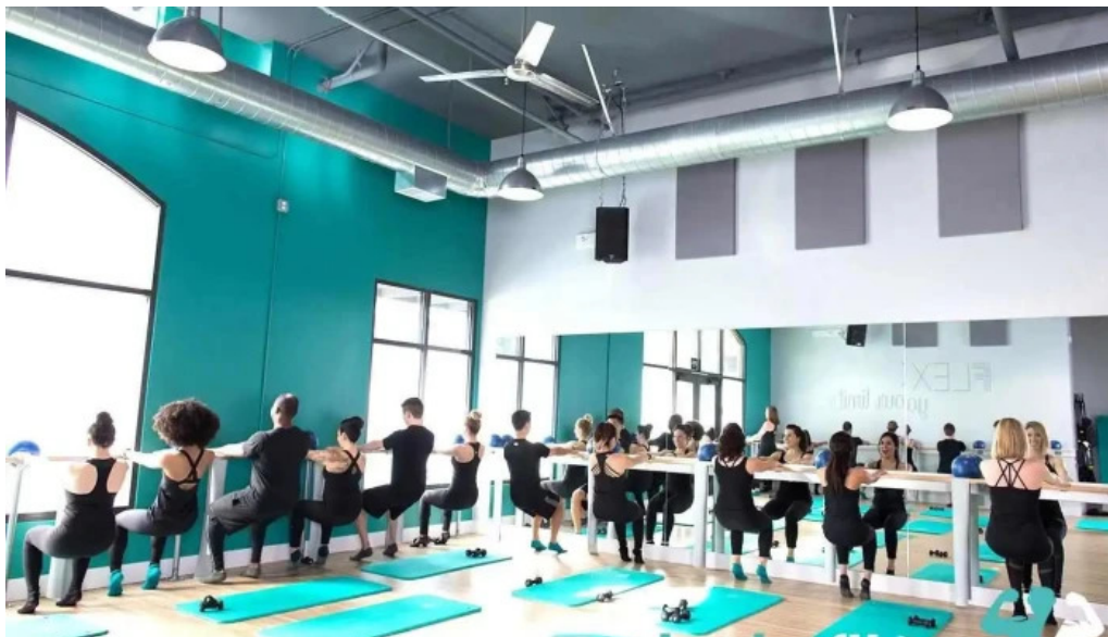
Flex fusion studios personal training group fitness classes and nutrition coaching in campbell all