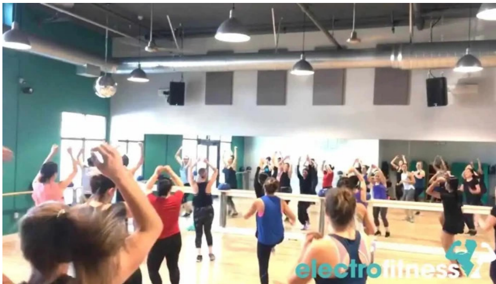
Flex fusion studios personal training group fitness classes and nutrition coaching in campbell videos