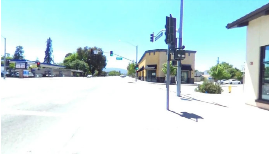
Flex fusion studios personal training group fitness classes and nutrition coaching in campbell street view 360deg