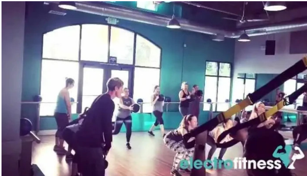
Flex fusion studios personal training group fitness classes and nutrition coaching in campbell by owner