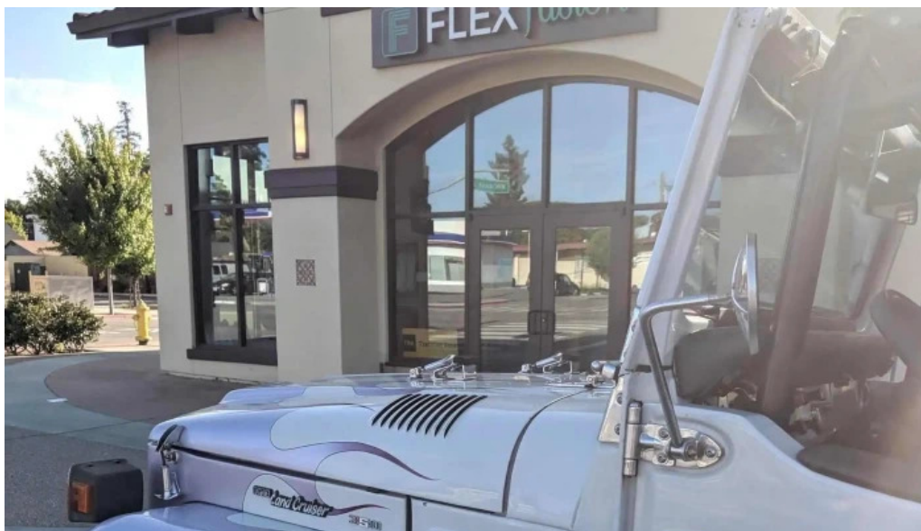
Flex fusion studios personal training group fitness classes and nutrition coaching in campbell fitness center