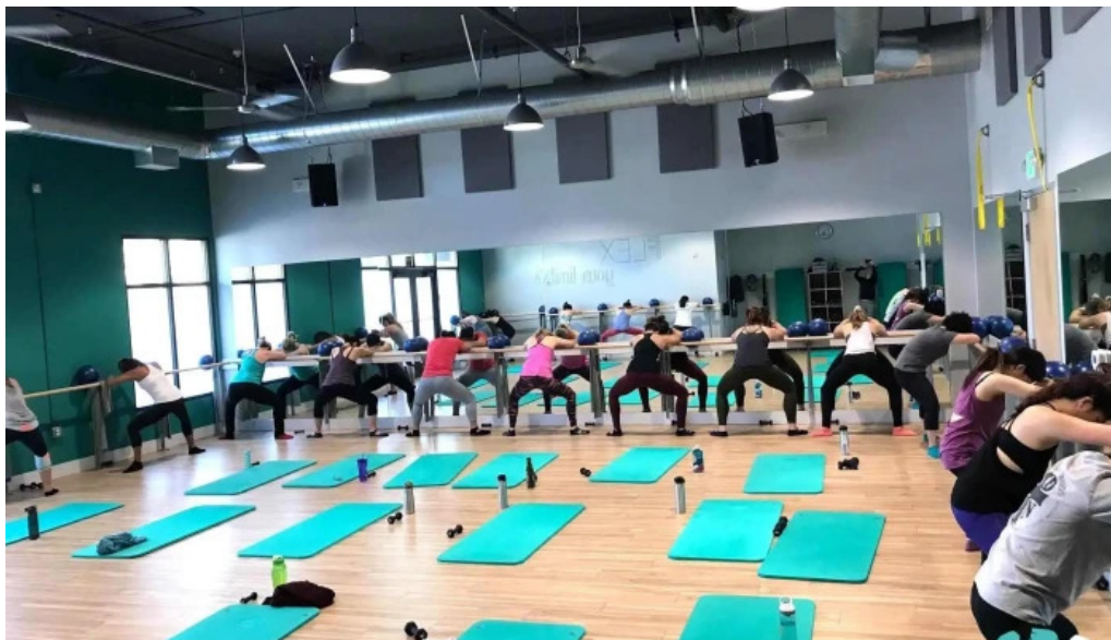
Flex fusion studios personal training group fitness classes and nutrition coaching in campbell gym