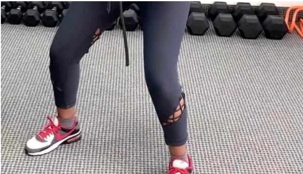
Five diamond fitness wellness gym