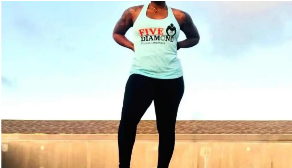
Five diamond fitness wellness dallas