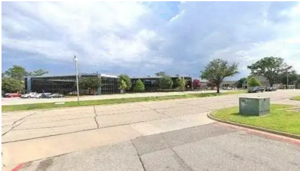
Five diamond fitness wellness street view 360deg