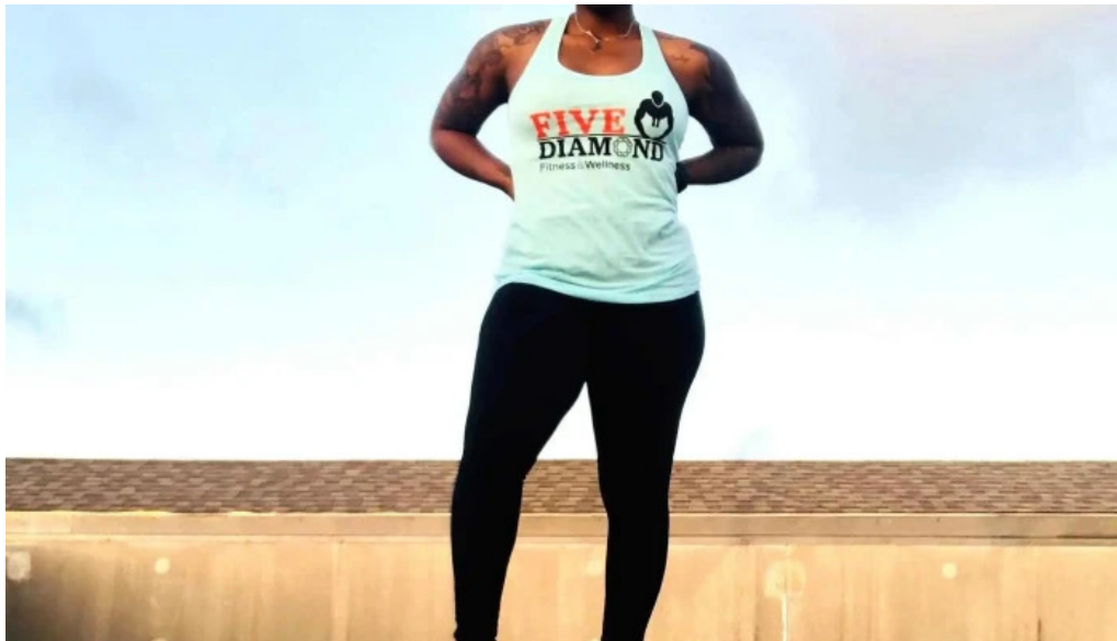
Five diamond fitness wellness all