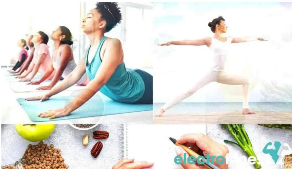
Five diamond fitness wellness by owner