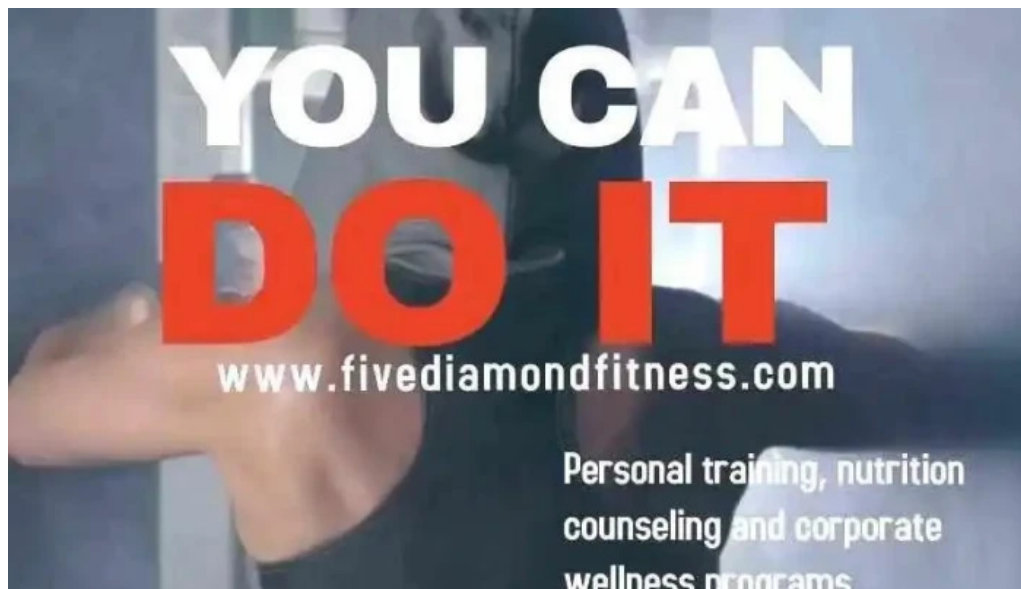
Five diamond fitness wellness videos