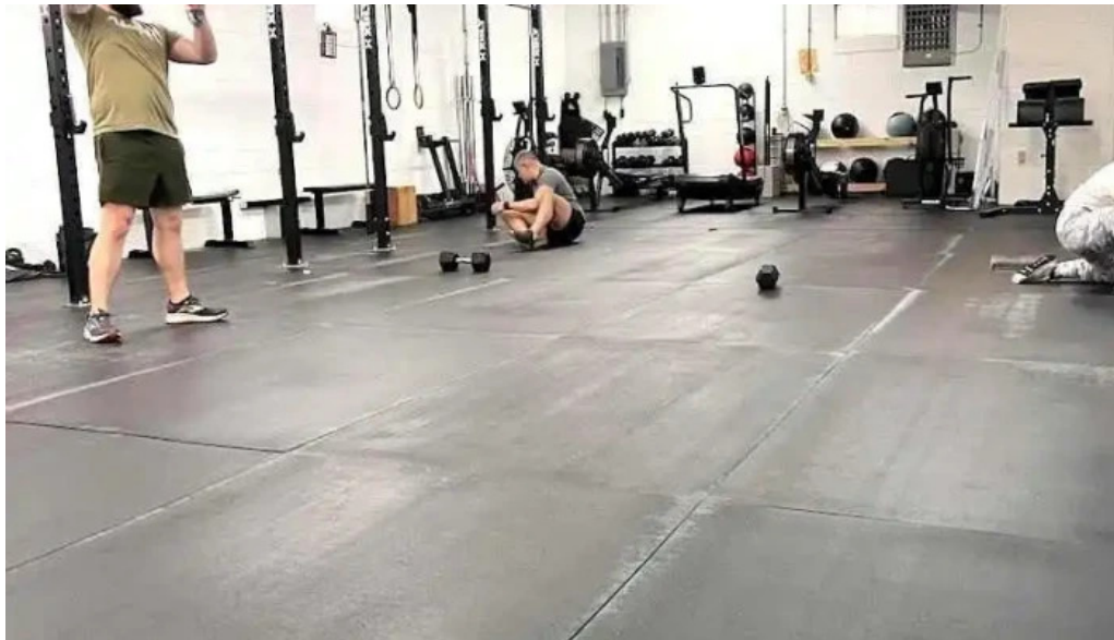
South fork gym glasgow