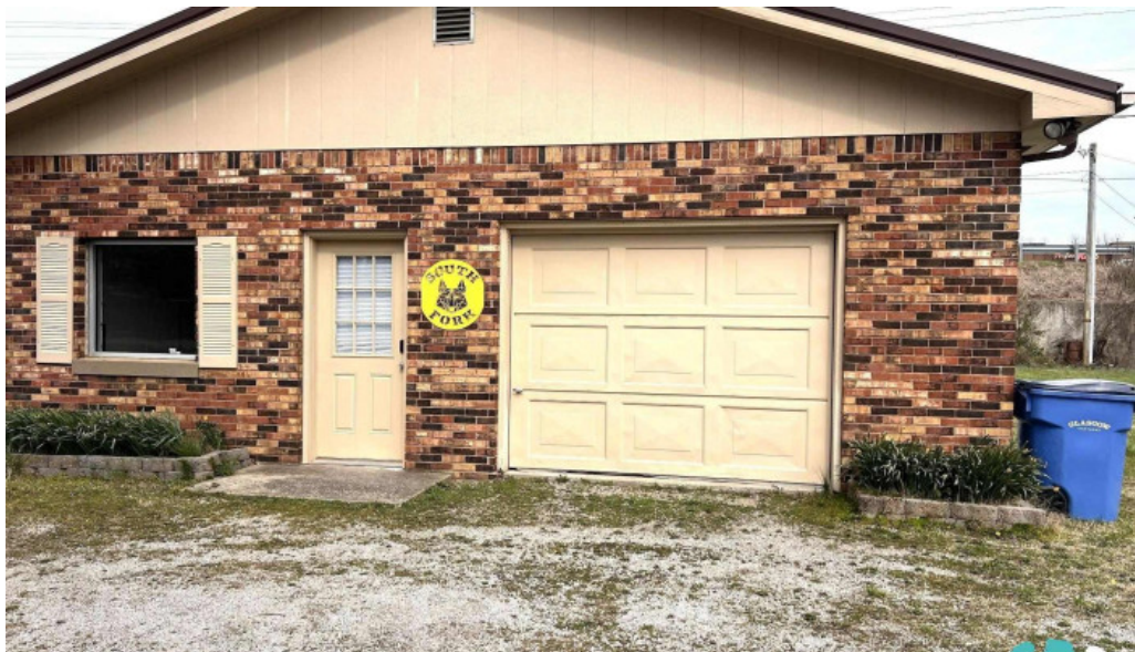
South fork gym latest