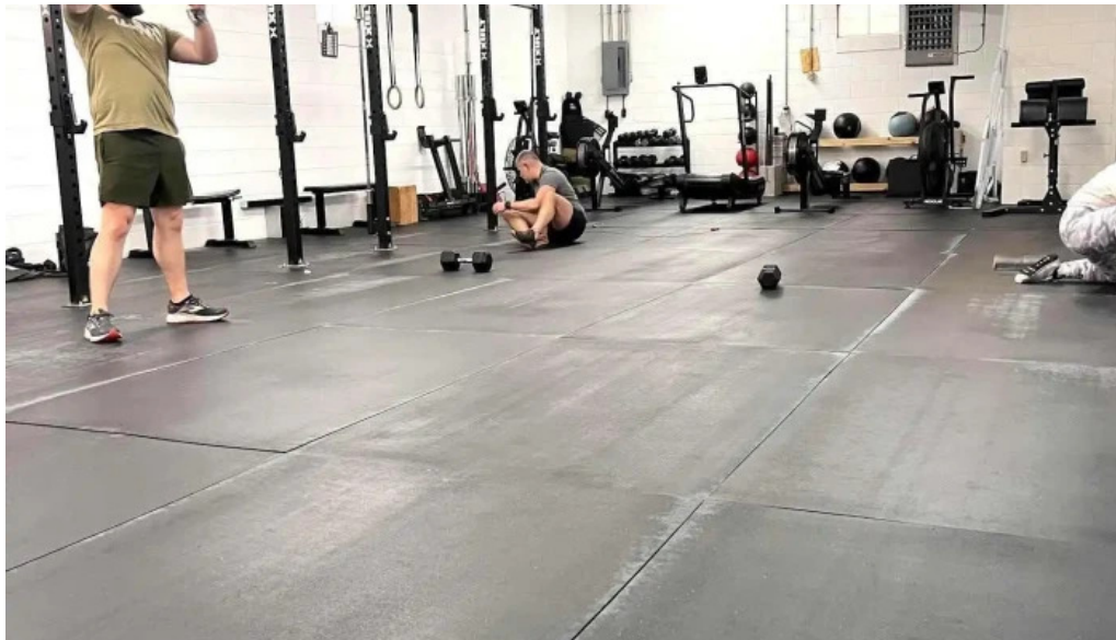
South fork gym all