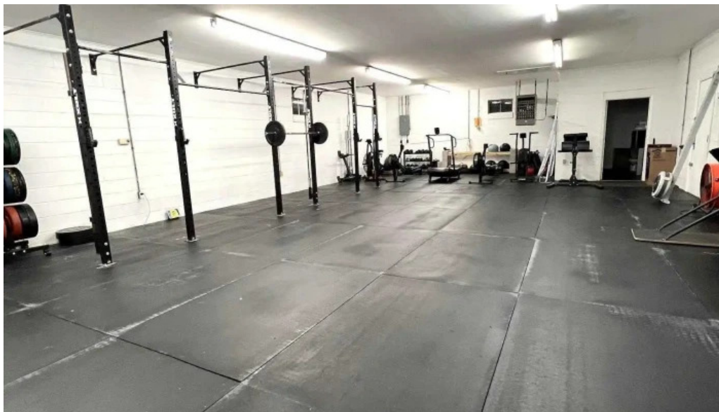
South fork gym by owner