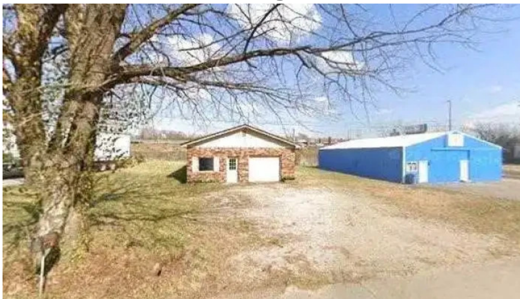
South fork gym street view 360deg