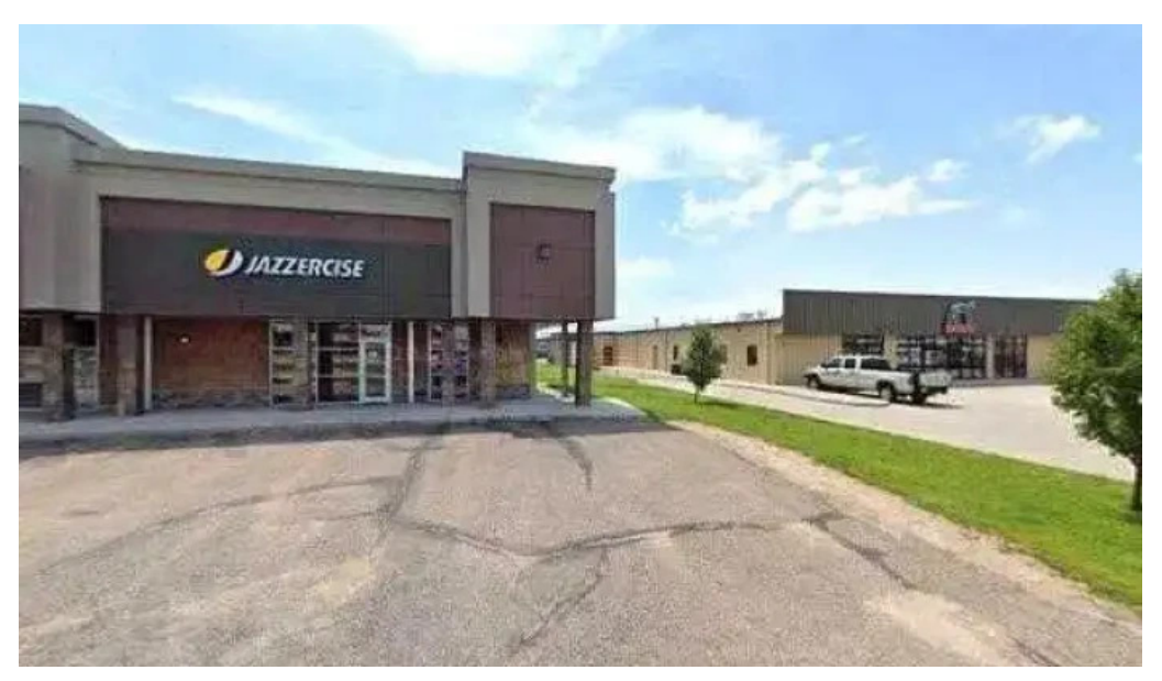
Jazzercise street view 360deg