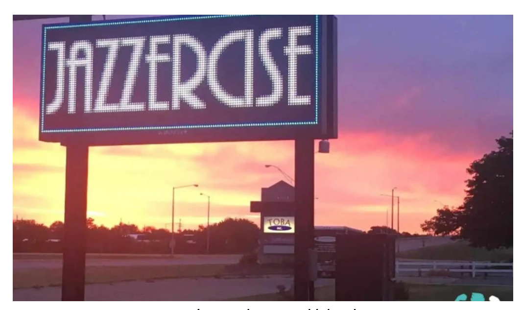
Jazzercise grand island