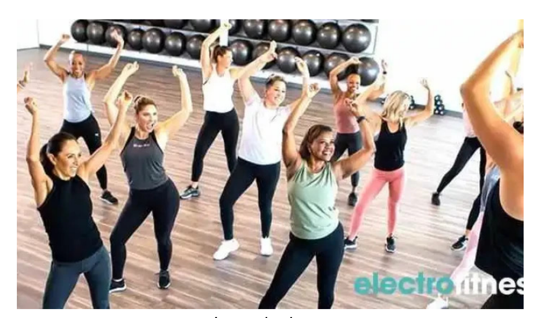
Jazzercise by owner