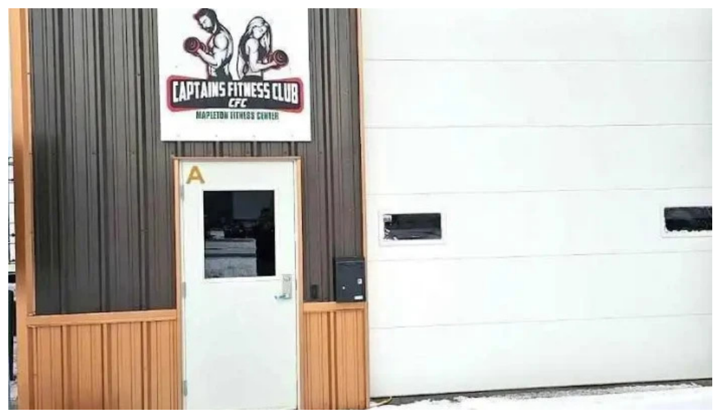
Captain s fitness club mapleton