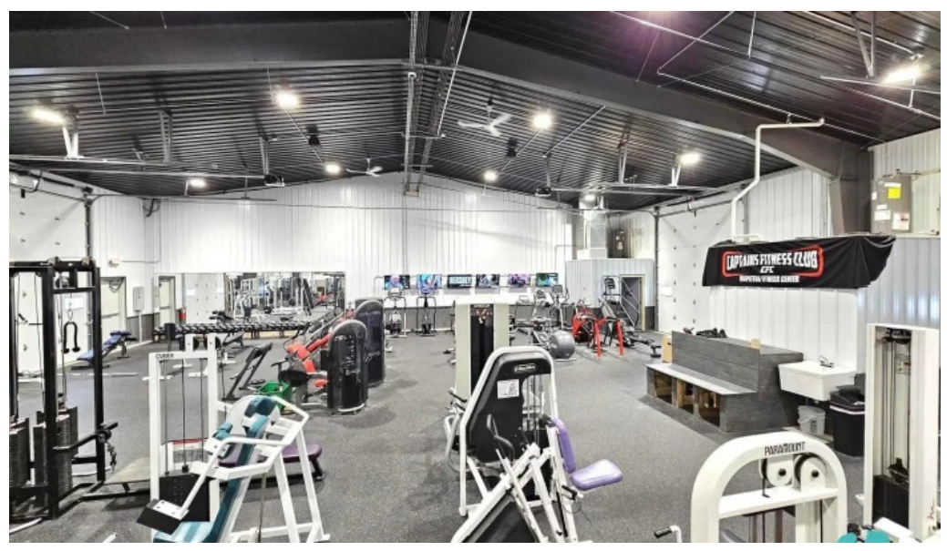
Captains fitness club by owner