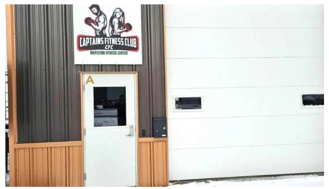
Captains fitness club all