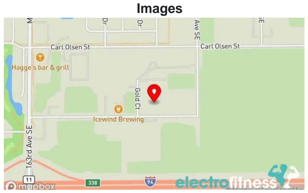
Captains fitness club map

In case you want to adjust any information that you think is incorrect about this site, we kindly request send us a message so we can we will adjust it quickly. Thank you in advance thank you very much.