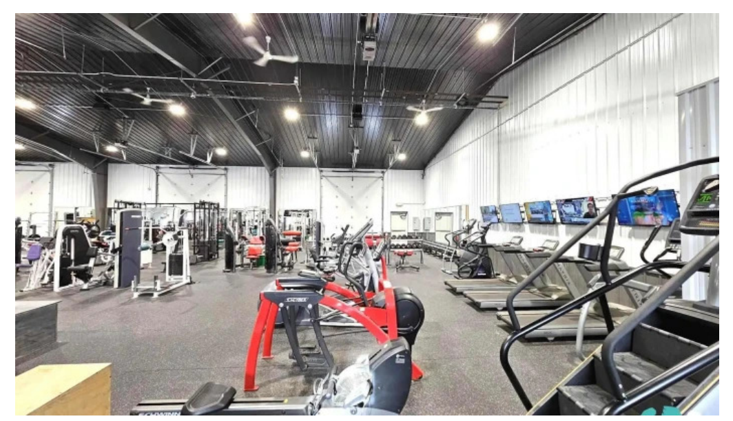
Captains fitness club gym