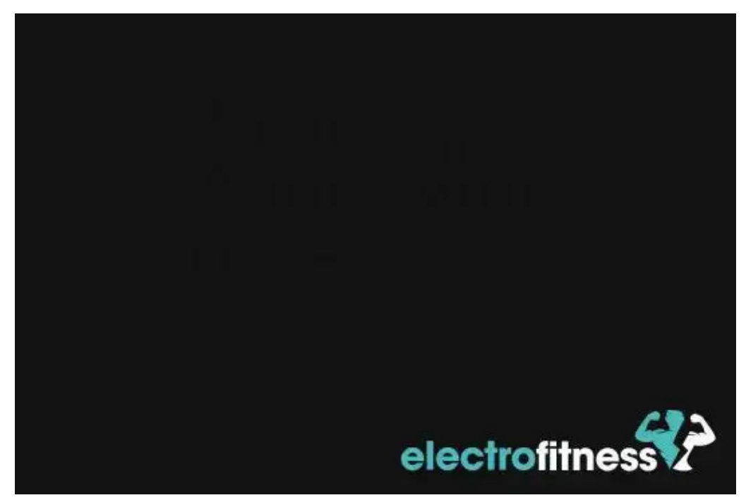
Gail grandchamp personal training fitness boxing self defense studio by owner