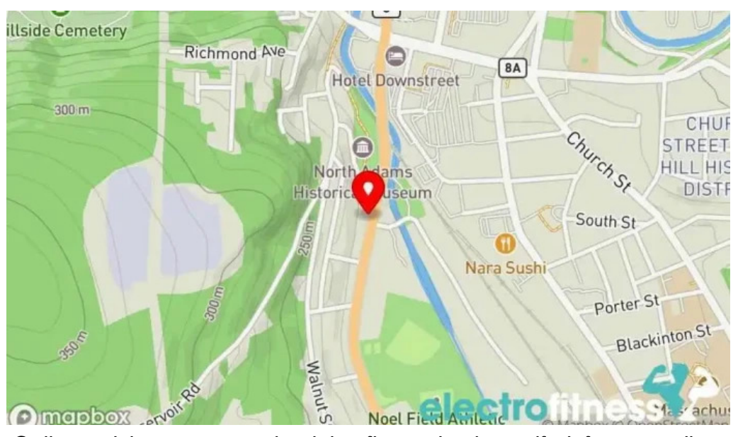
Gail grandchamp personal training fitness boxing self defense studio map