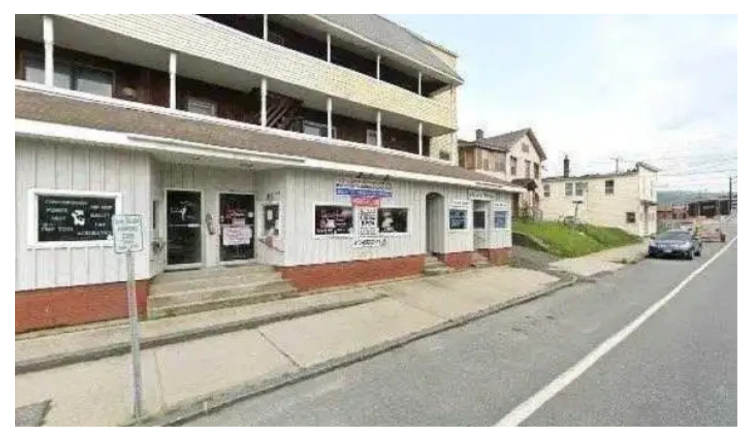
Gail grandchamp personal training fitness boxing self defense studio street view 360deg