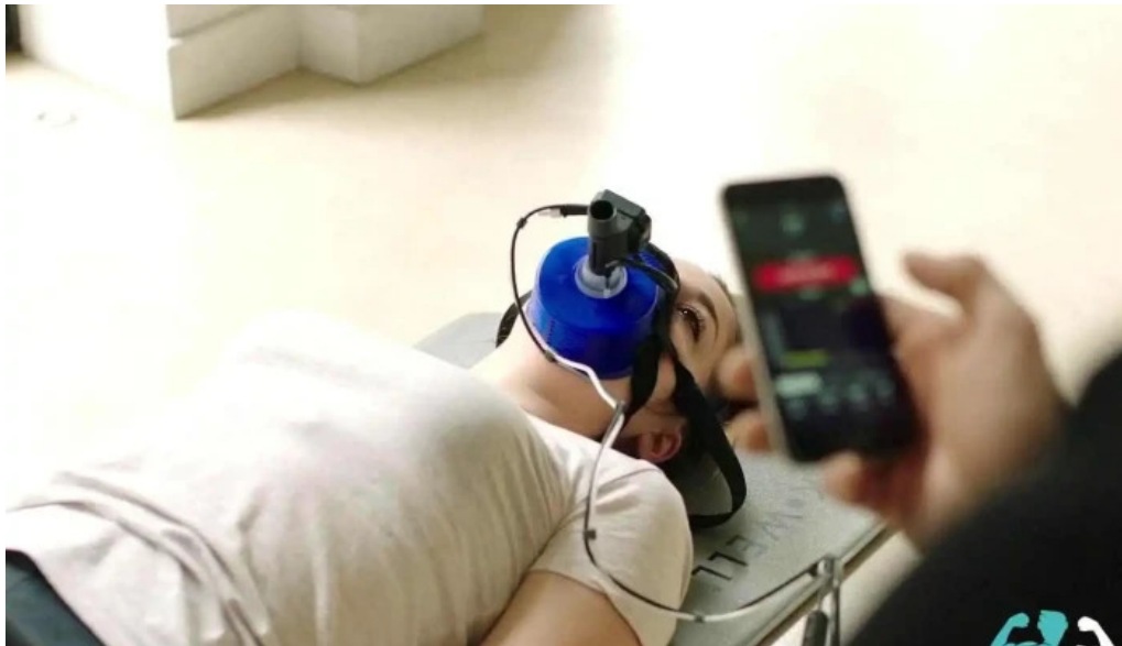
New you crew nutrition fitness by owner