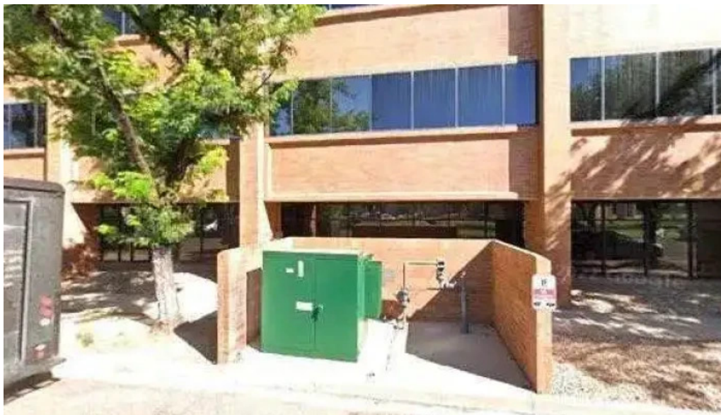
New you crew nutrition fitness all