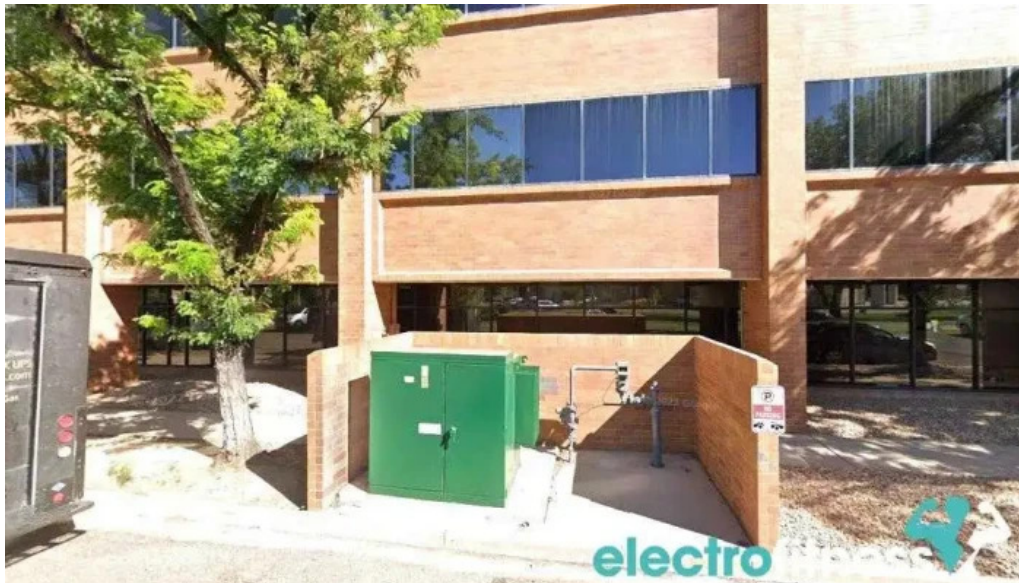
New you crew nutrition fitness northglenn