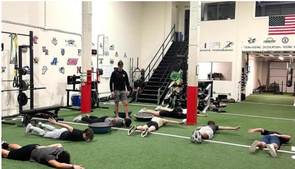
Mb performance institute gym gym