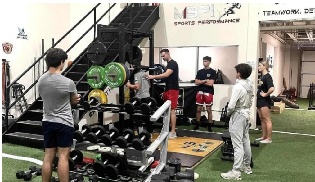
Mb performance institute gym all