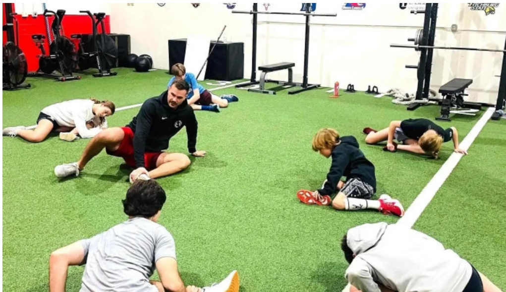
Mb performance institute gym by owner