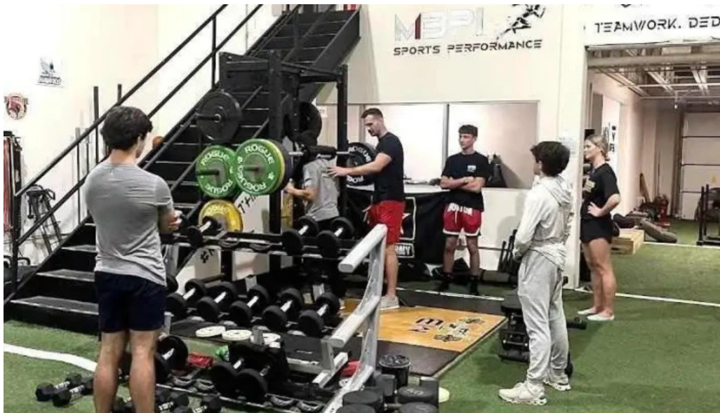
Mb performance institute gym plymouth