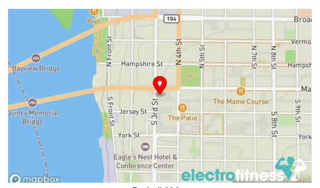
Barbell 828 map