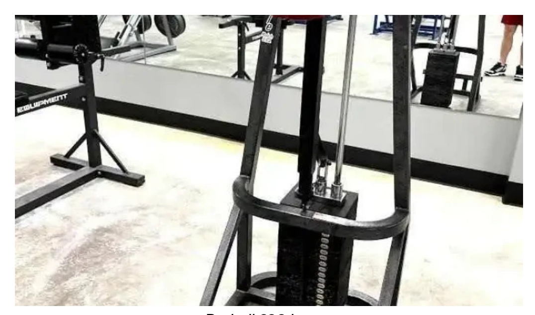
Barbell 828 by owner