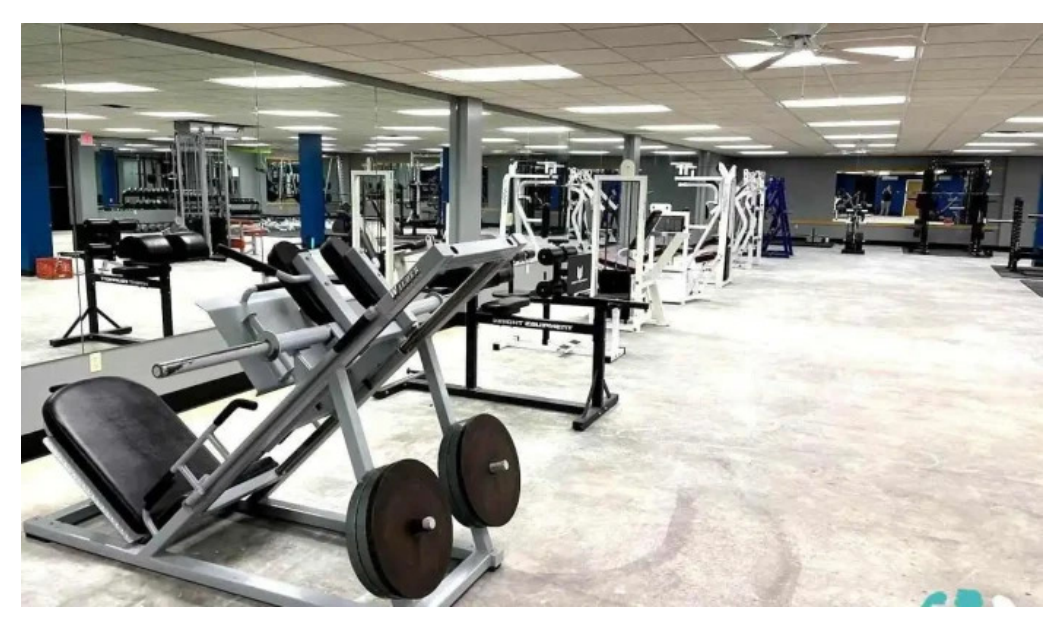
Barbell 828 gym