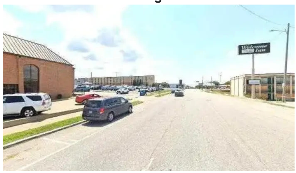
Barbell 828 street view 360deg