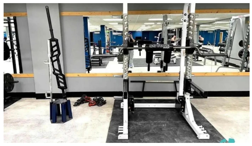
Barbell 828 quincy