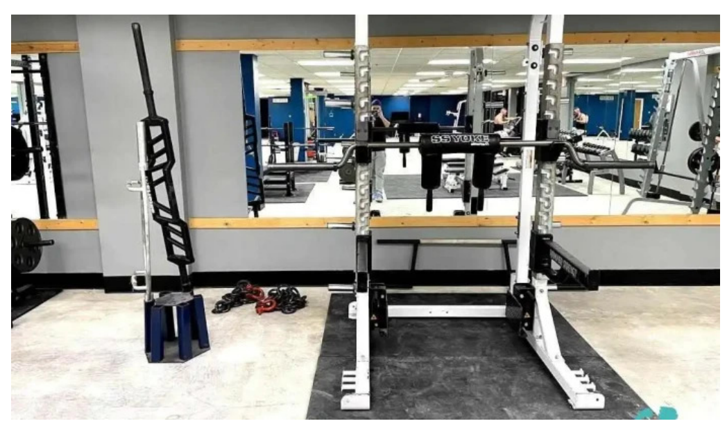
Barbell 828 all