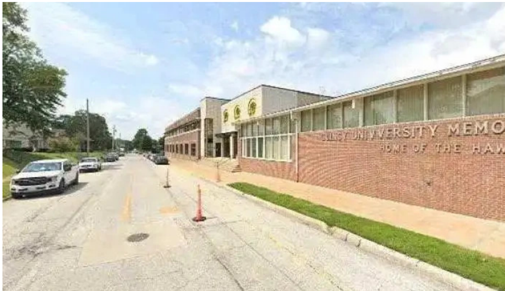
Quincy university health fitness center street view 360deg