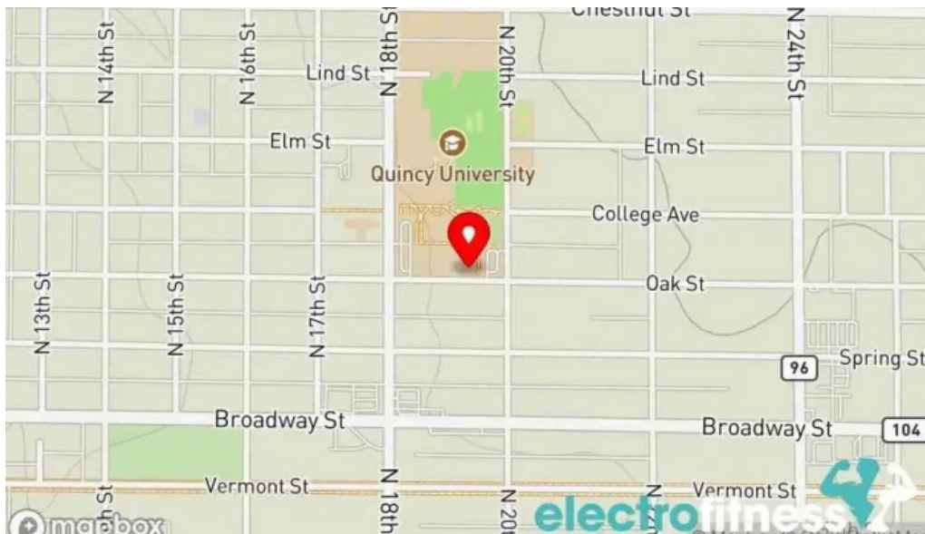
Quincy university health fitness center map