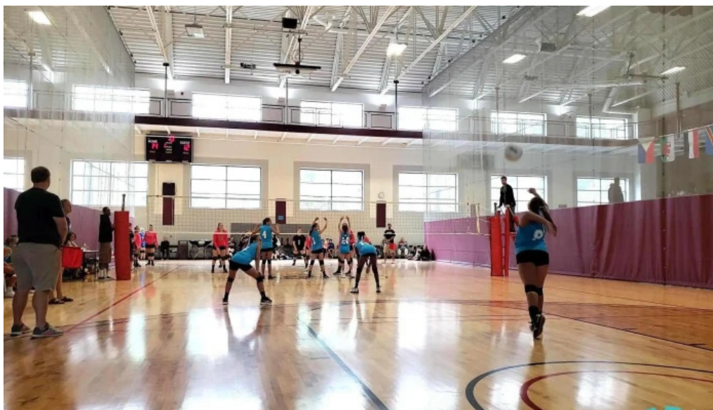
Quincy university health fitness center all