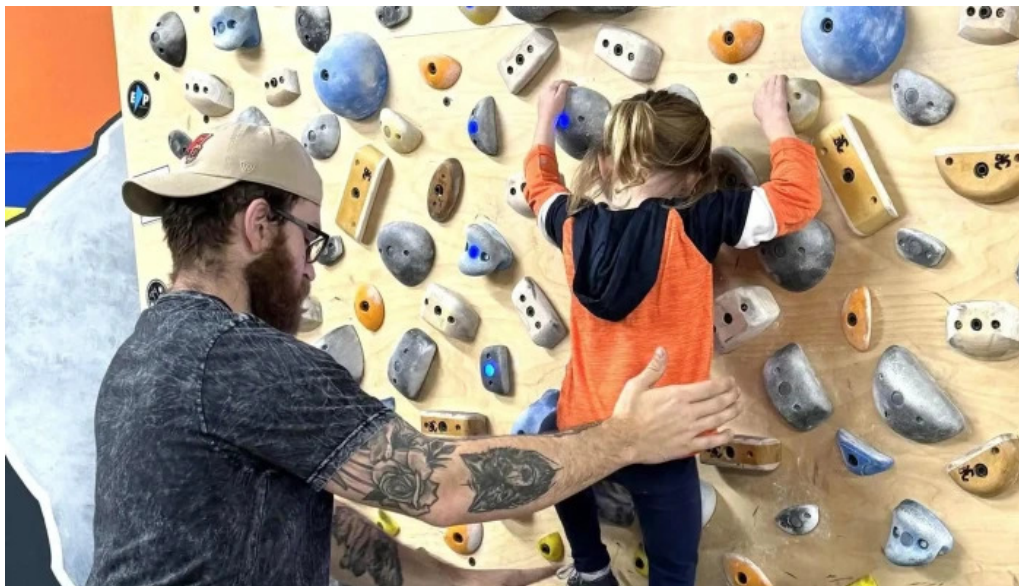
Alliance fitness center spring ridge reading