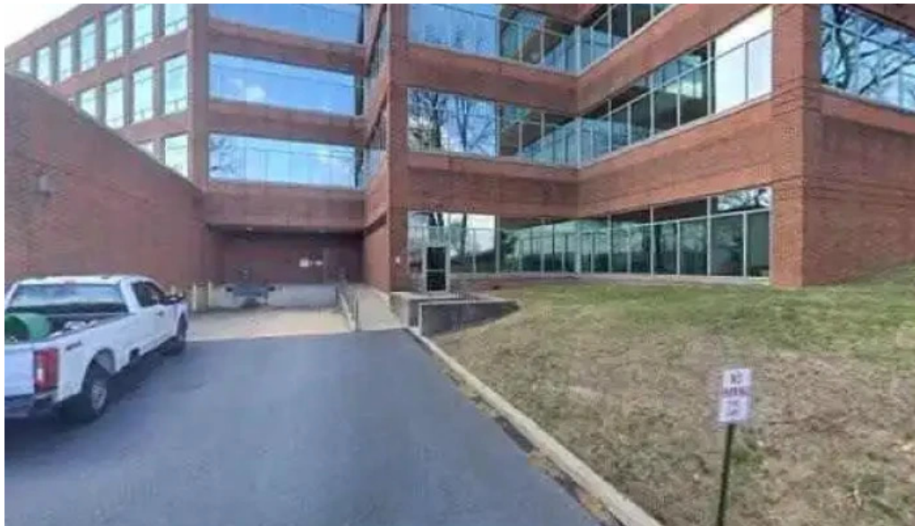
Alliance fitness center spring ridge all