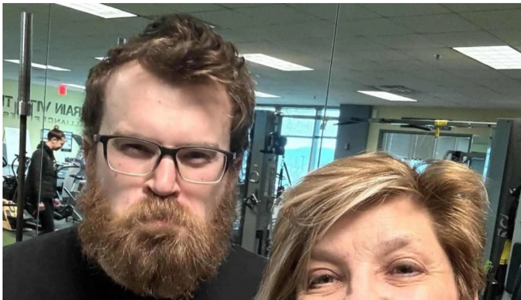
Alliance fitness center spring ridge fitness center