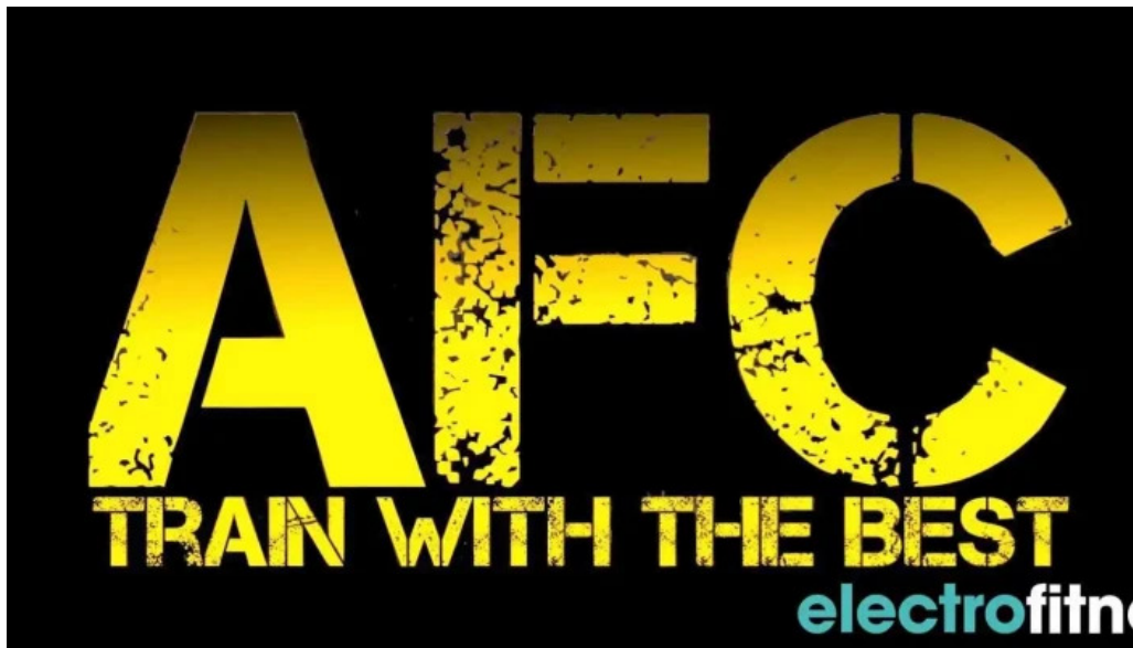
Alliance fitness center spring ridge by owner