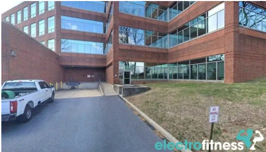
Alliance fitness center spring ridge reading