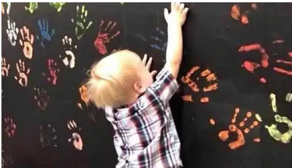
Fitness made fun by owner