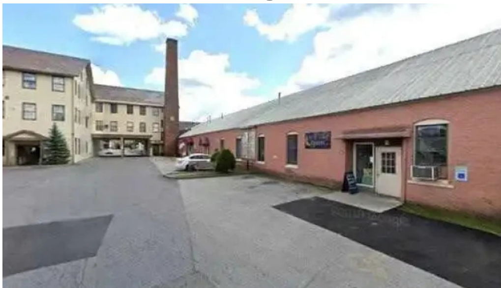
Fitness made fun street view 360deg