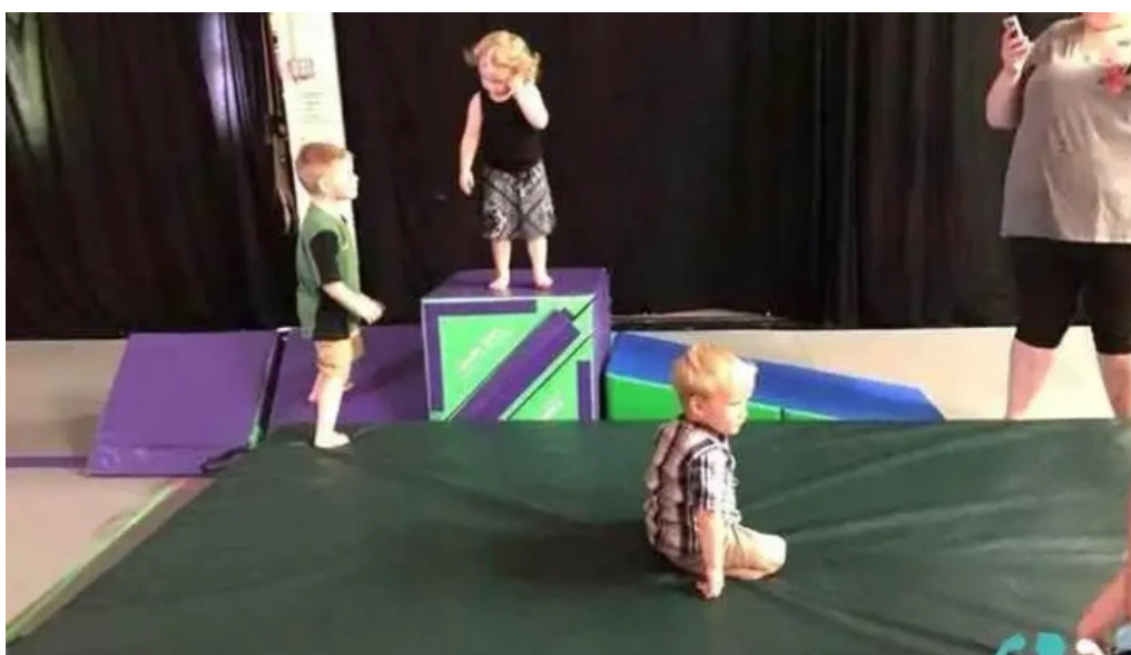
Fitness made fun all