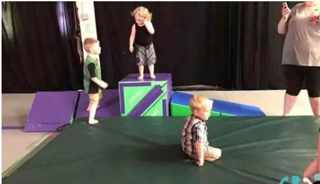
Fitness made fun rutland