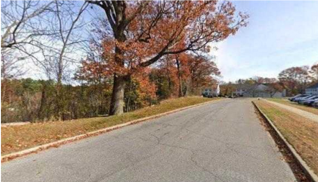
The edge sports fitness street view 360deg