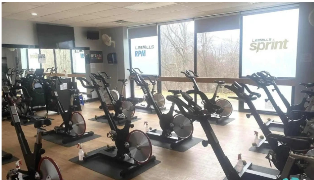
The edge sports fitness gym