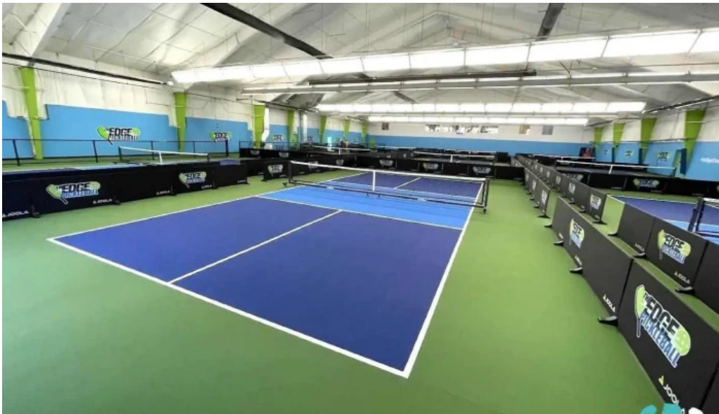
The edge sports fitness south burlington