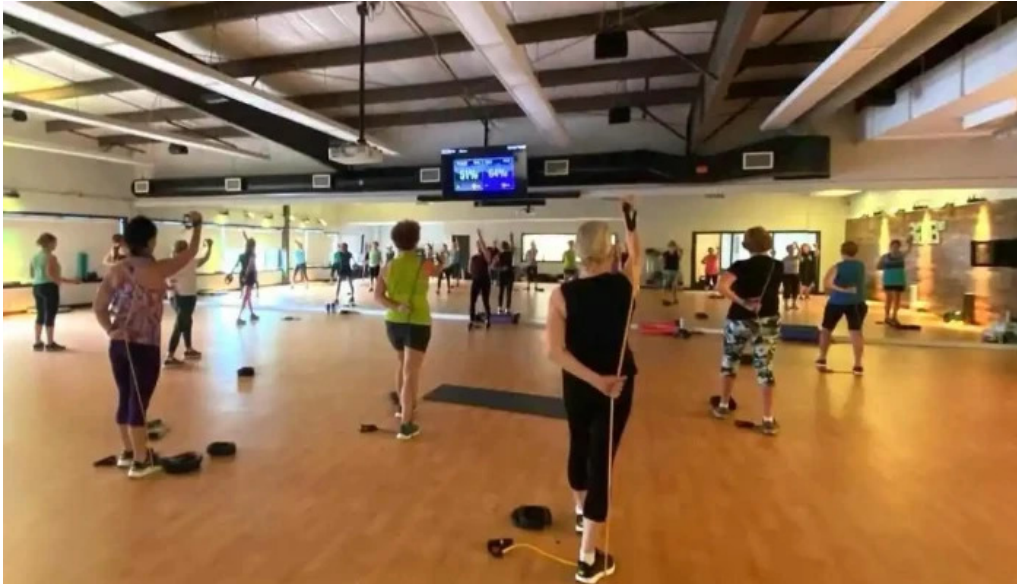
The edge sports fitness by owner