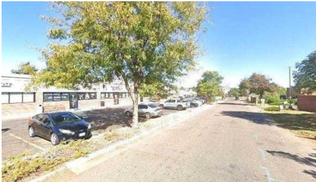
Jazzercise street view 360deg