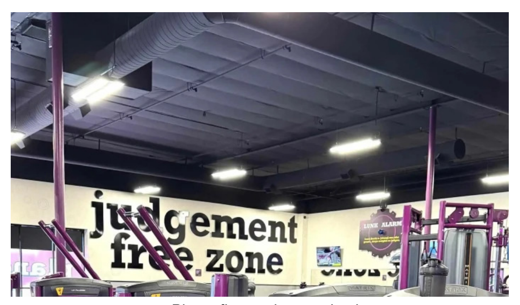
Planet fitness thousand oaks