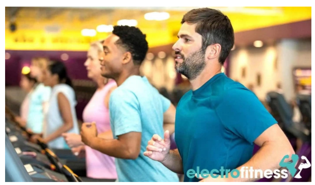
Planet fitness all