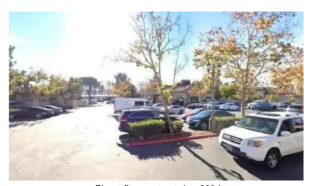
Planet fitness street view 360deg