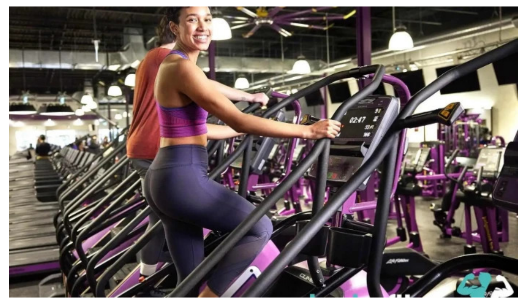
Planet fitness gym