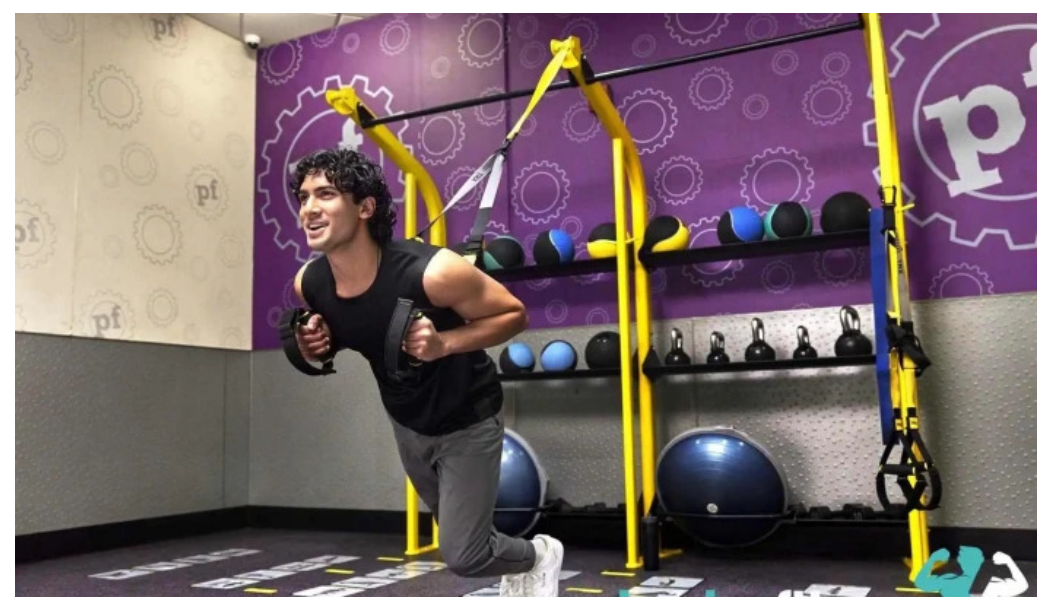
Planet fitness by owner