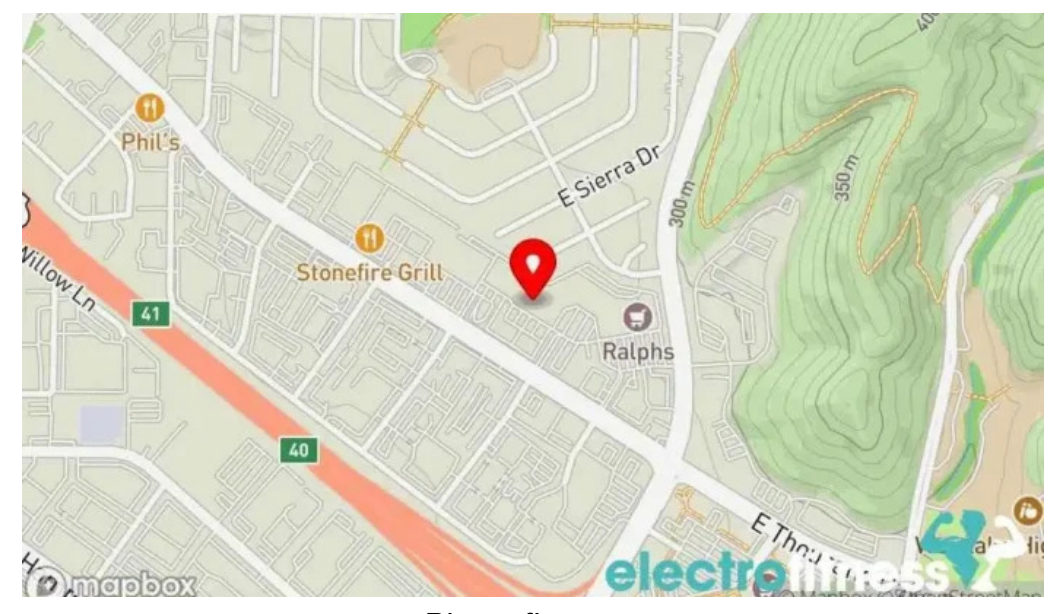
Planet fitness map