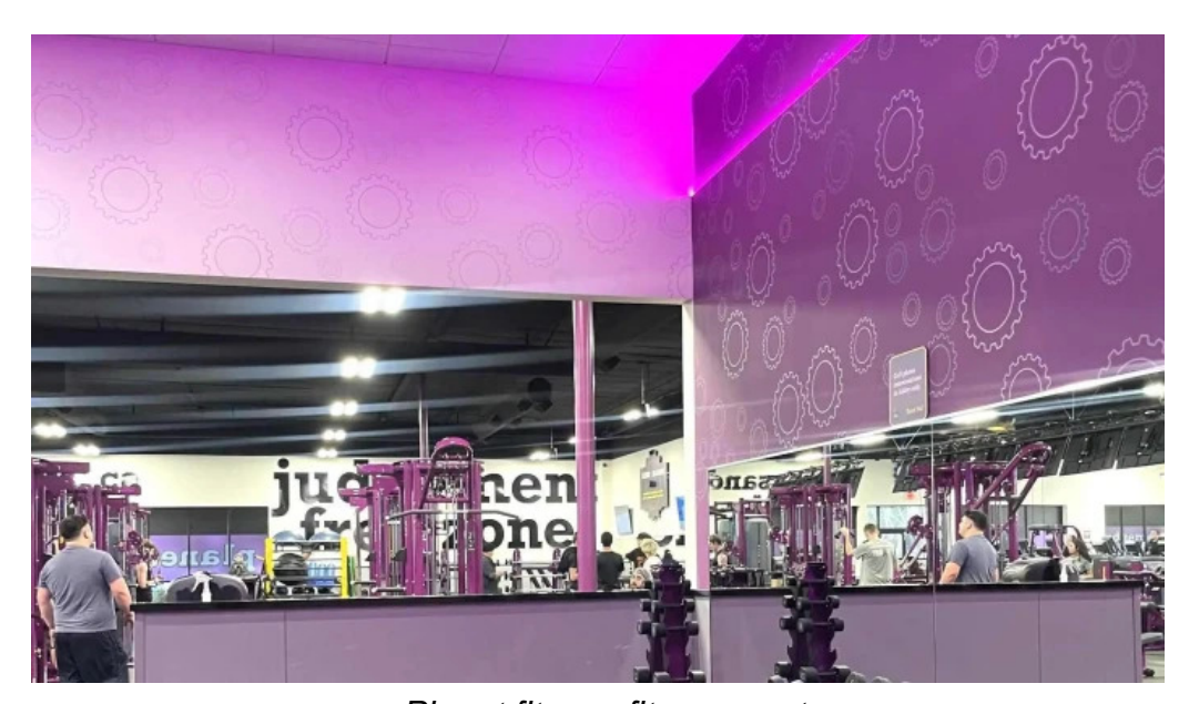
Planet fitness fitness center