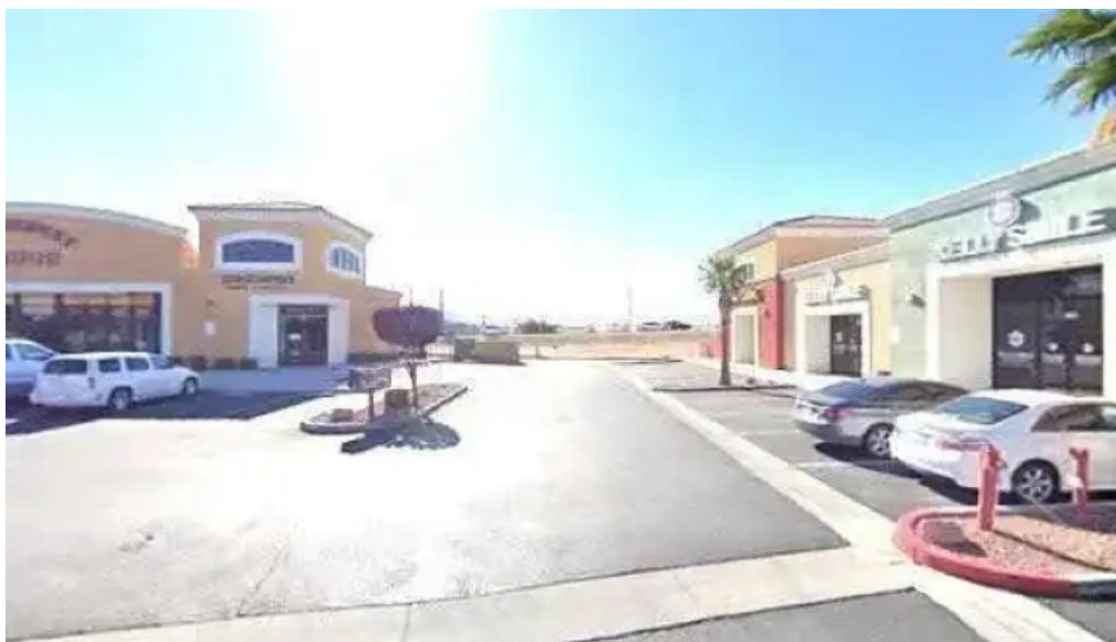
Trident fitness performance all