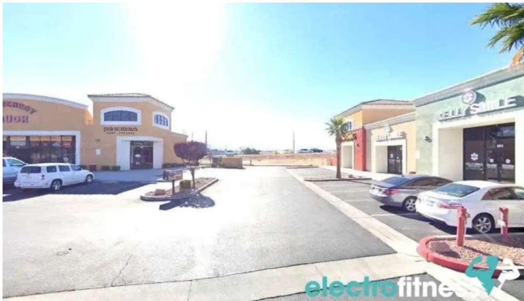
Trident fitness performance victorville