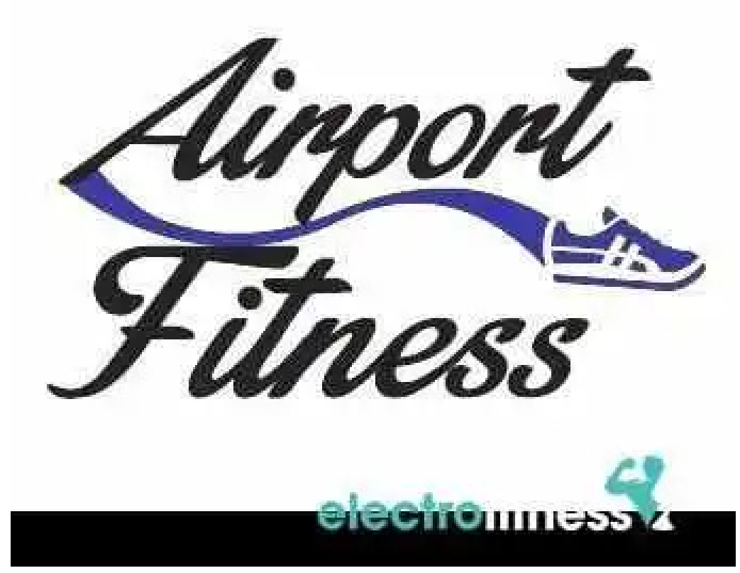
Airport fitness by owner