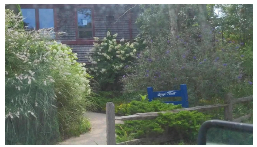
Airport fitness catalog