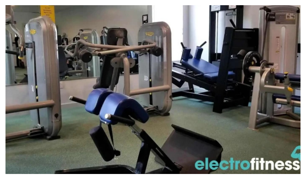
Airport fitness gym