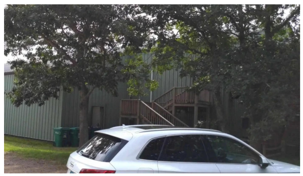
Airport fitness vineyard haven