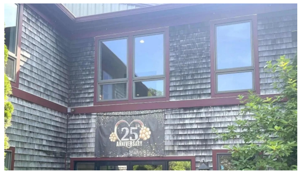
Airport fitness fitness center