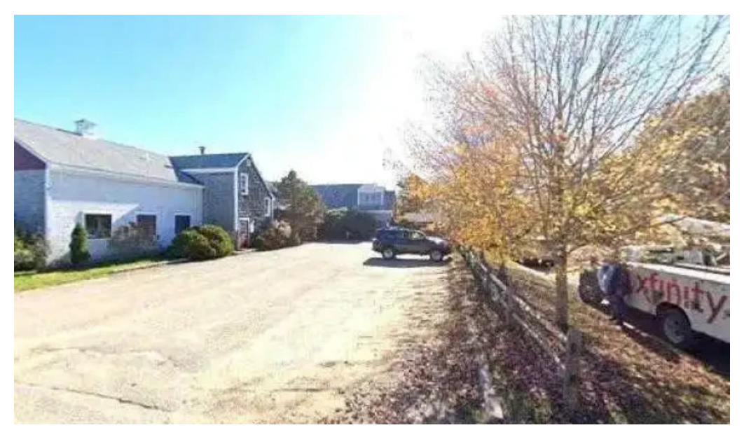
Airport fitness street view 360deg