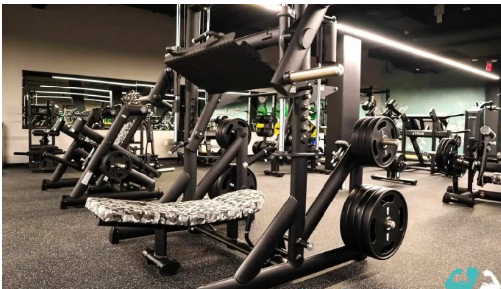
Golds gym noma center by owner