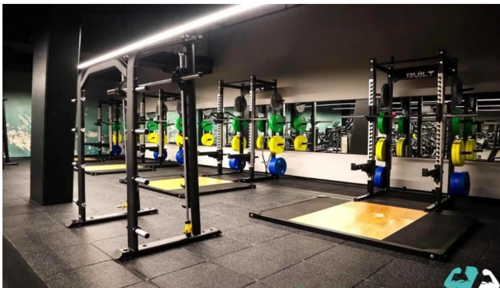
Golds gym noma center gym