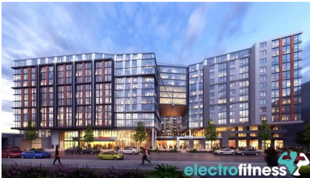
Gold s gym noma center washington