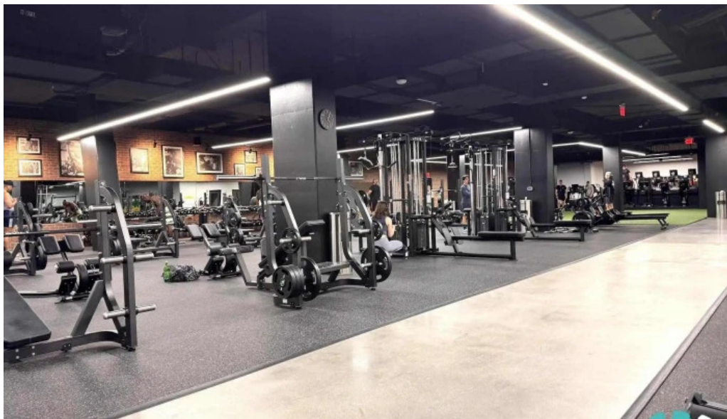
Golds gym noma center latest