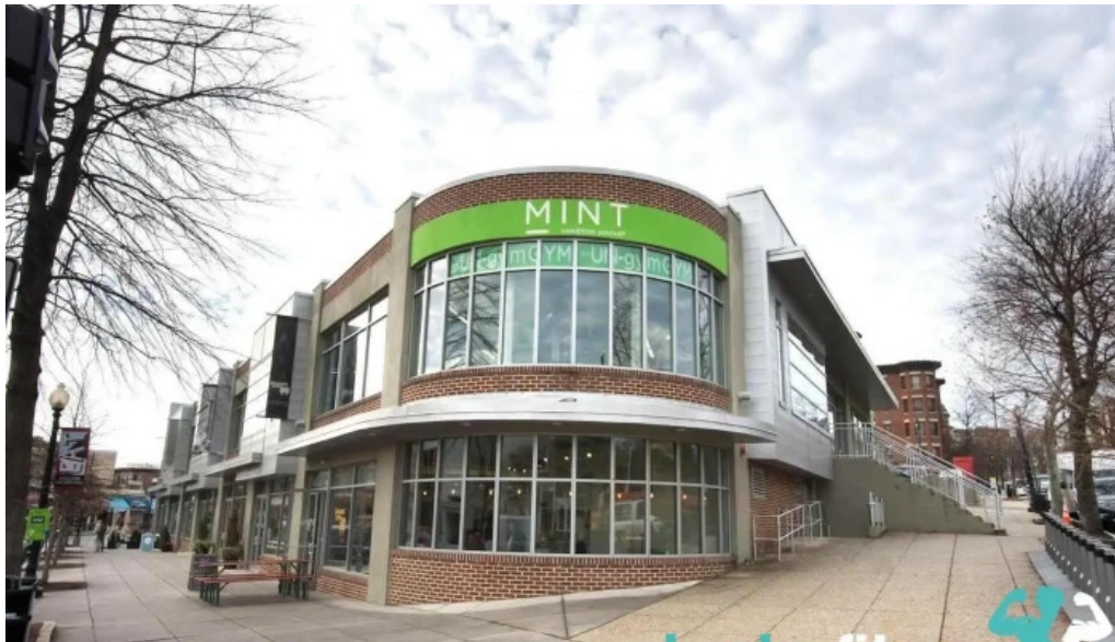
Mint gym studio washington