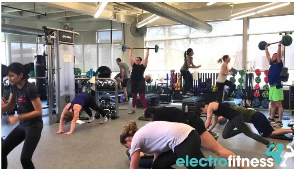
Mint gym studio videos