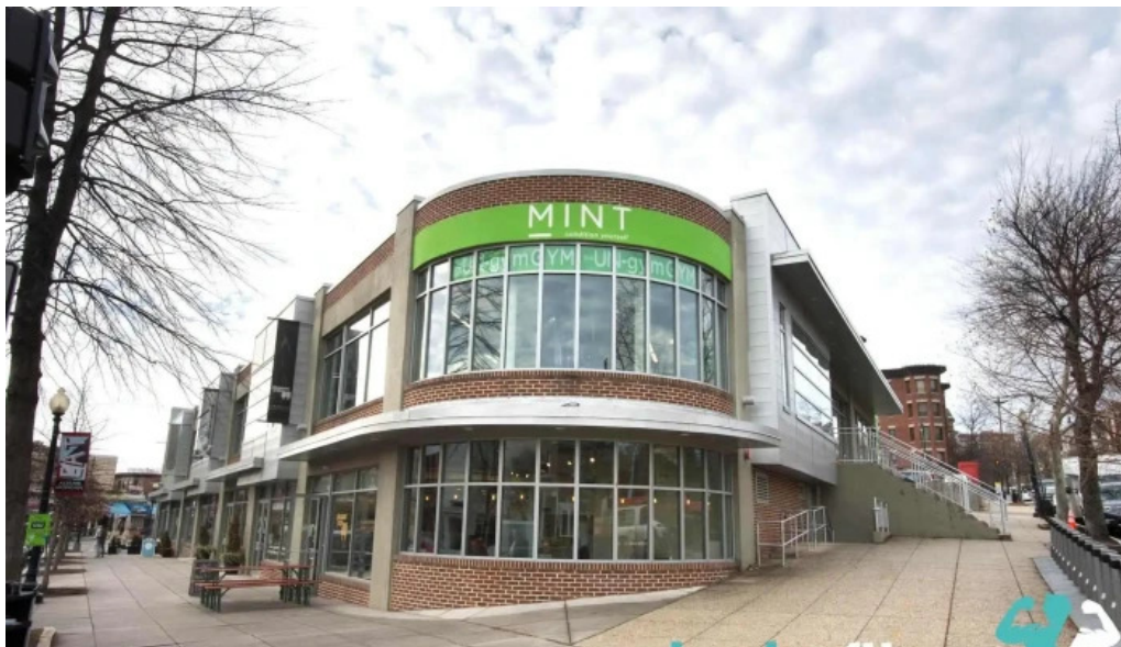
Mint gym studio all