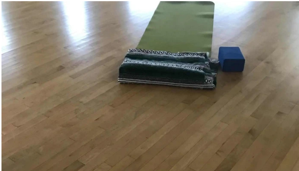
Mint gym studio fitness center