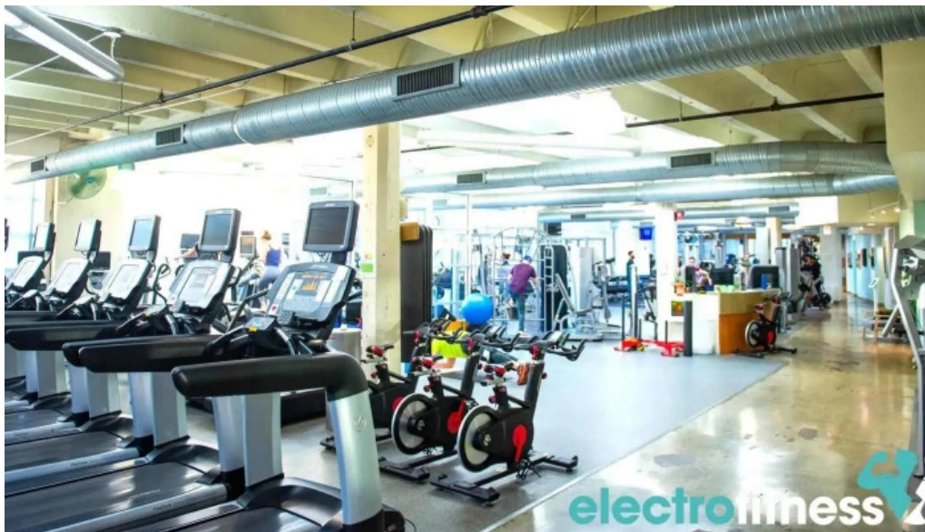
Mint gym studio exercise machine