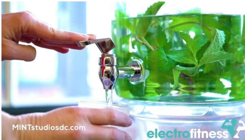
Mint gym studio by owner