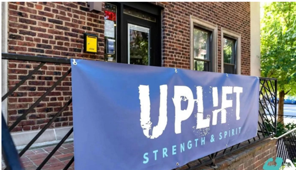
Uplift strength spirit by owner