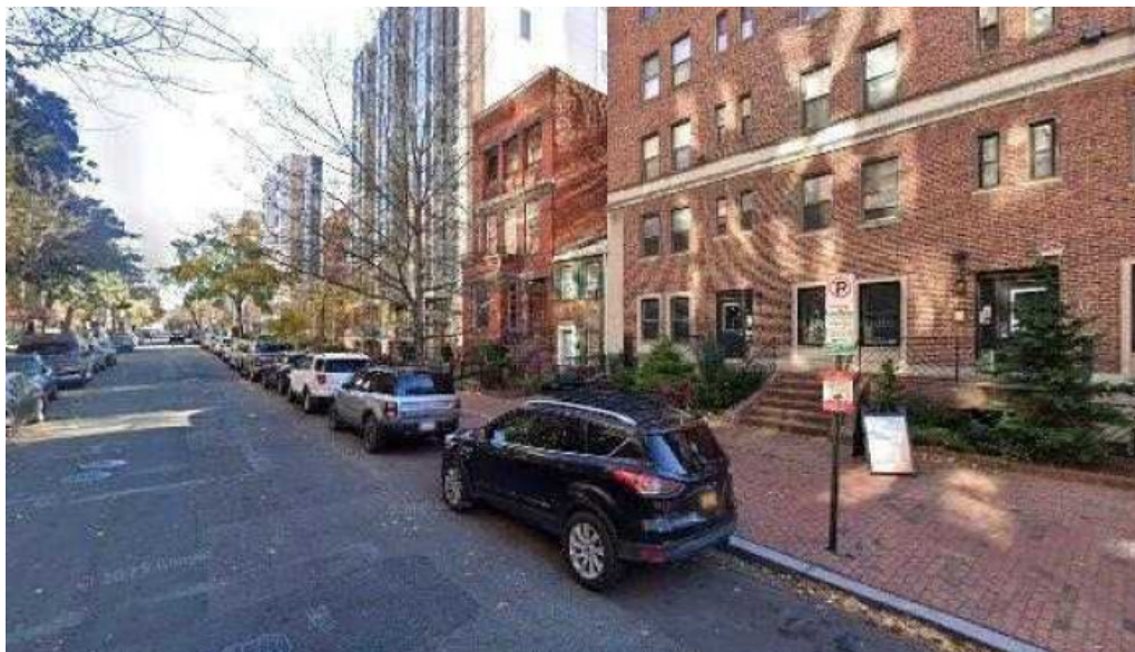
Uplift strength spirit street view 360deg