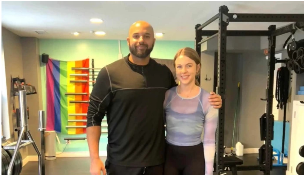
Uplift strength spirit fitness center