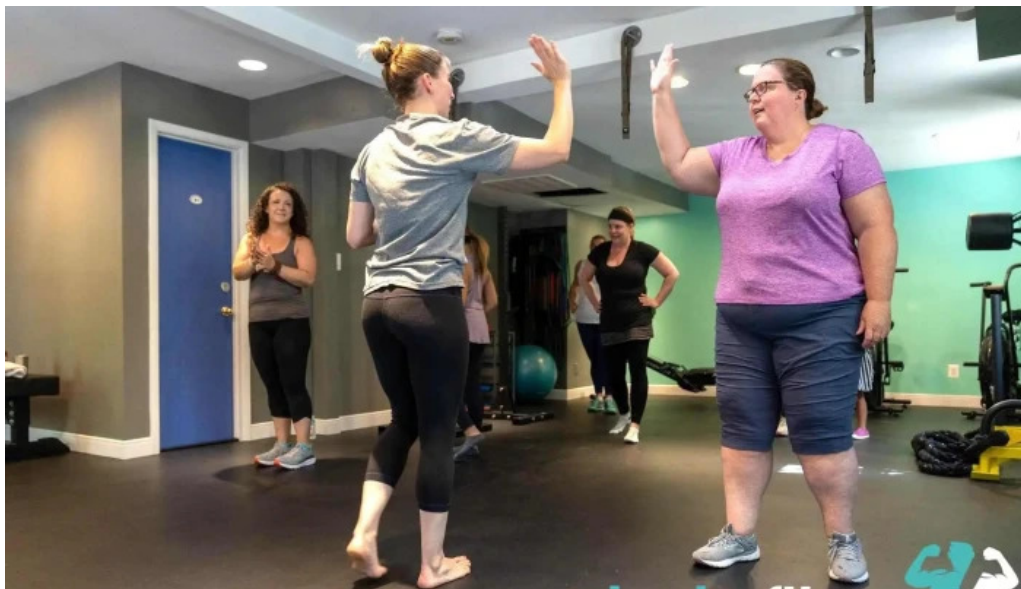
Uplift strength spirit gym