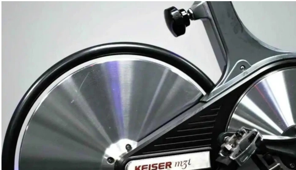
Advance cycling yoga by owner