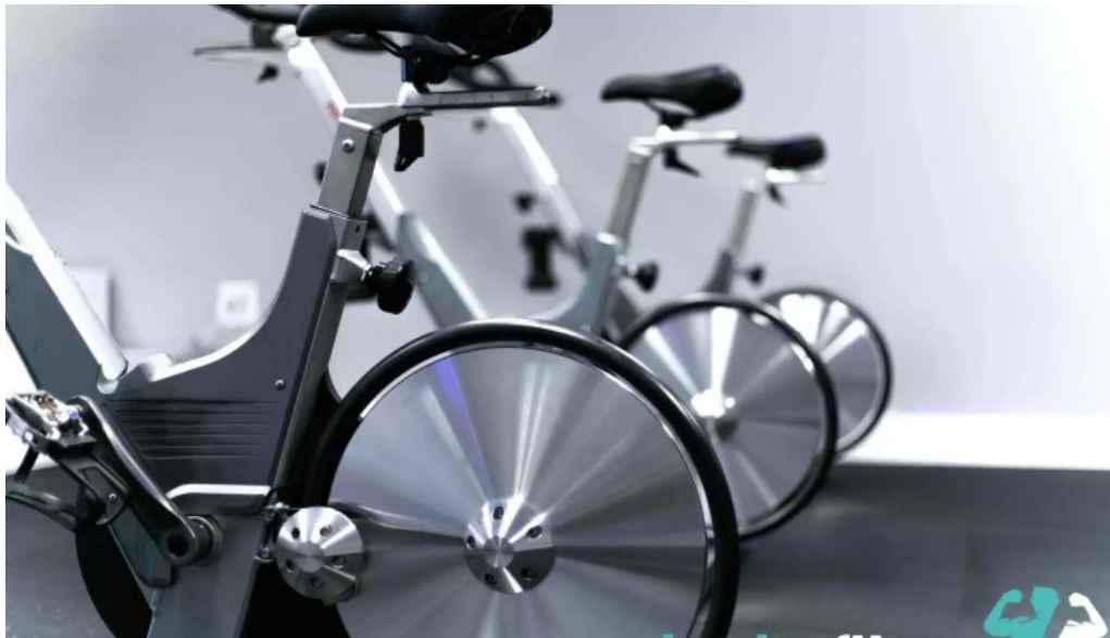
Advance cycling yoga all