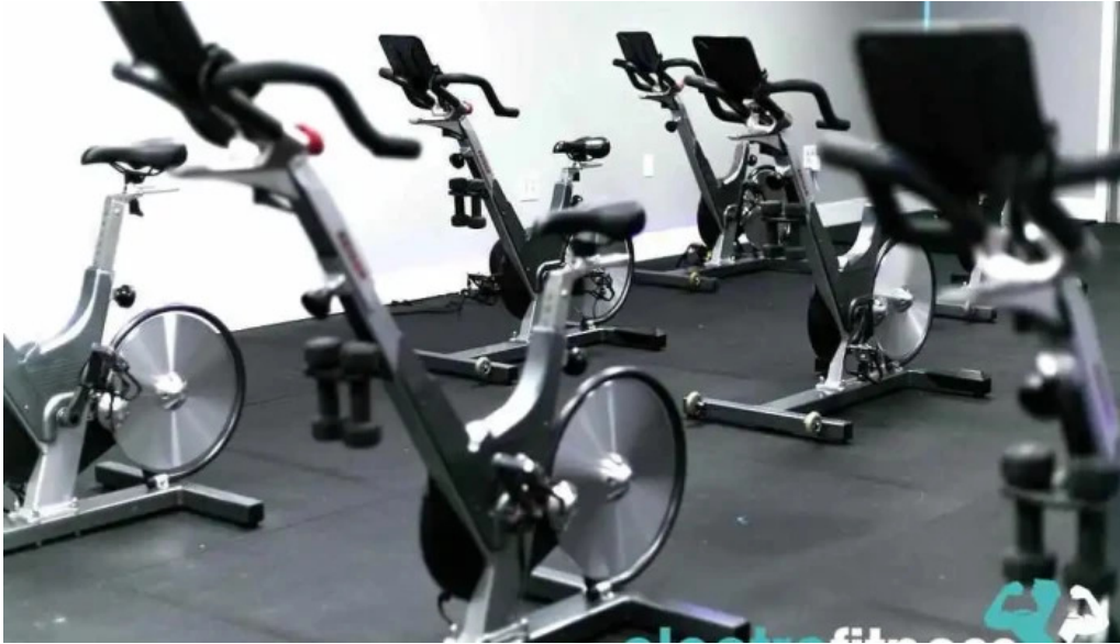
Advance cycling yoga gym