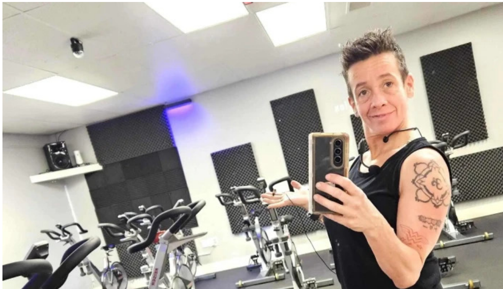
Advance cycling yoga westport