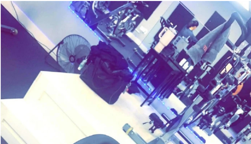
Advance cycling yoga fitness center