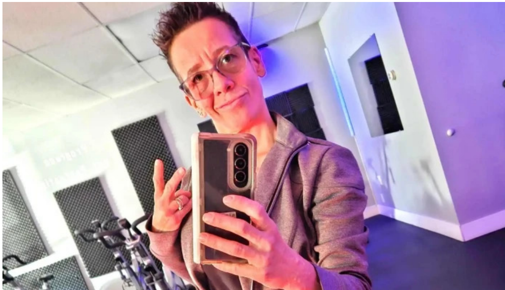
Advance cycling yoga instagram