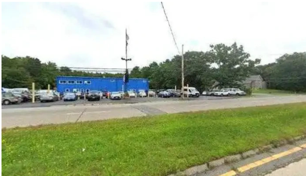
Advance cycling yoga street view 360deg