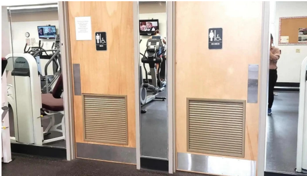
Health and fitness gym