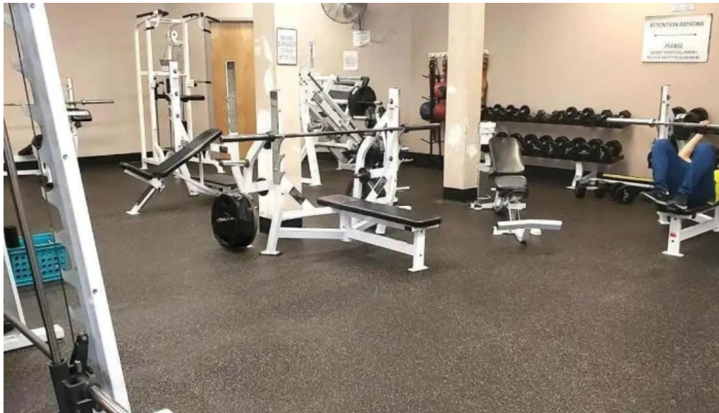
Health and fitness aberdeen proving ground