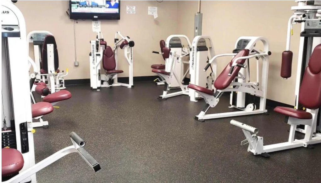
Health and fitness exercise machine