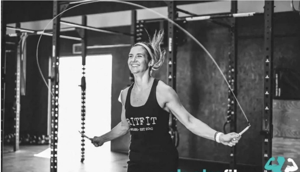
Gritfit abilene gym