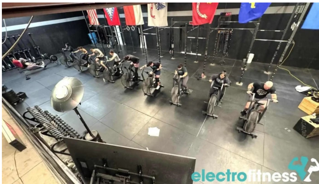
Grifit abilene latest