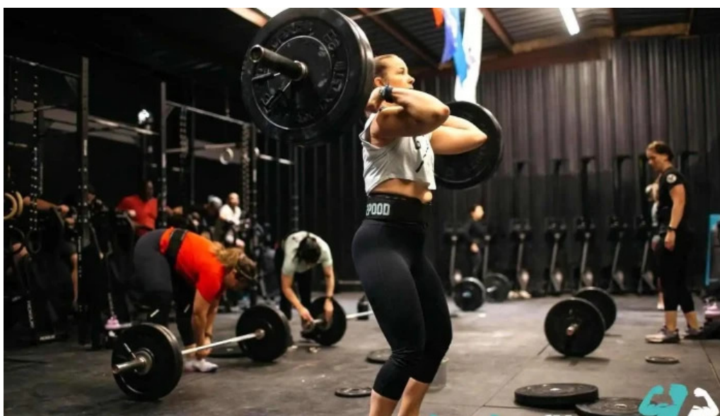
Gritfit abilene abilene