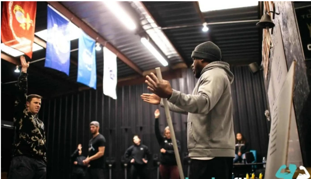
Gritfit abilene by owner