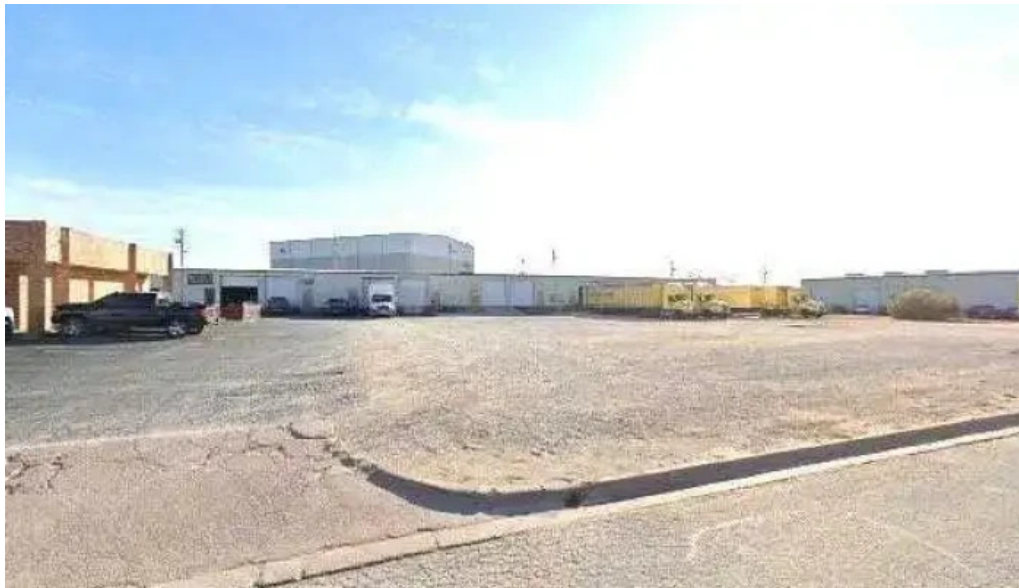
Gritfit abilene street view 360deg