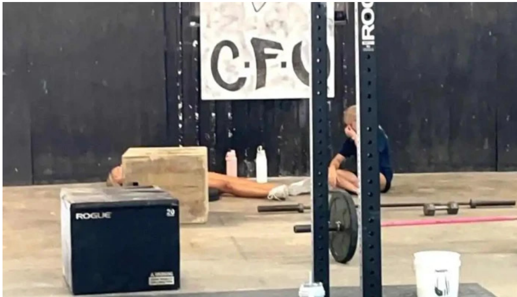
580 barbell club crossfit unforgiven by owner