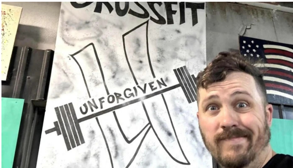
580 barbell club crossfit unforgiven gym