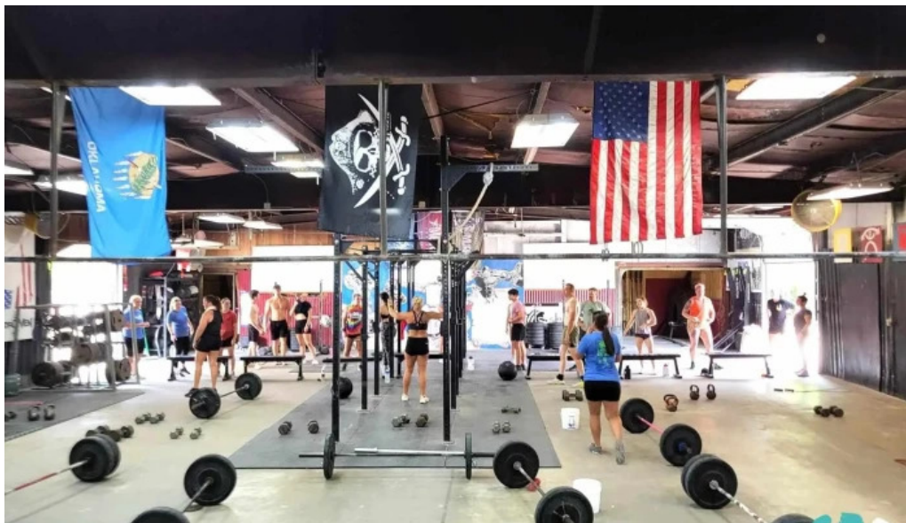
580 barbell club crossfit unforgiven all