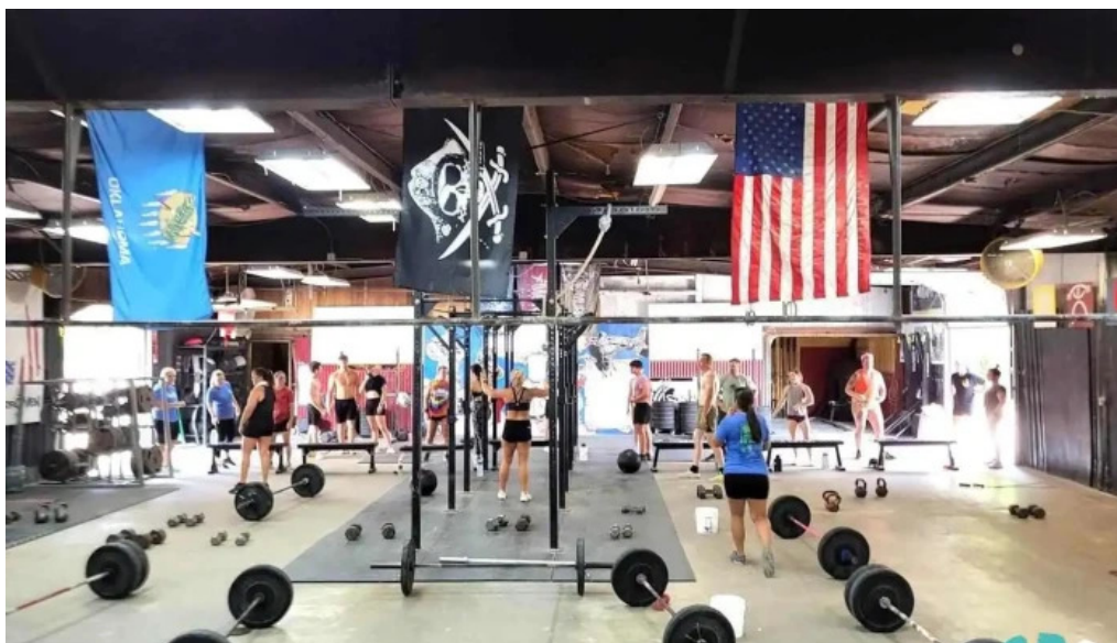
580 barbell club crossfit unforgiven ada