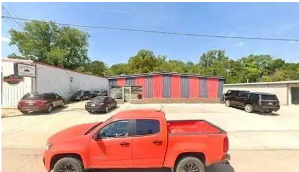
580 barbell club crossfit unforgiven street view 360deg