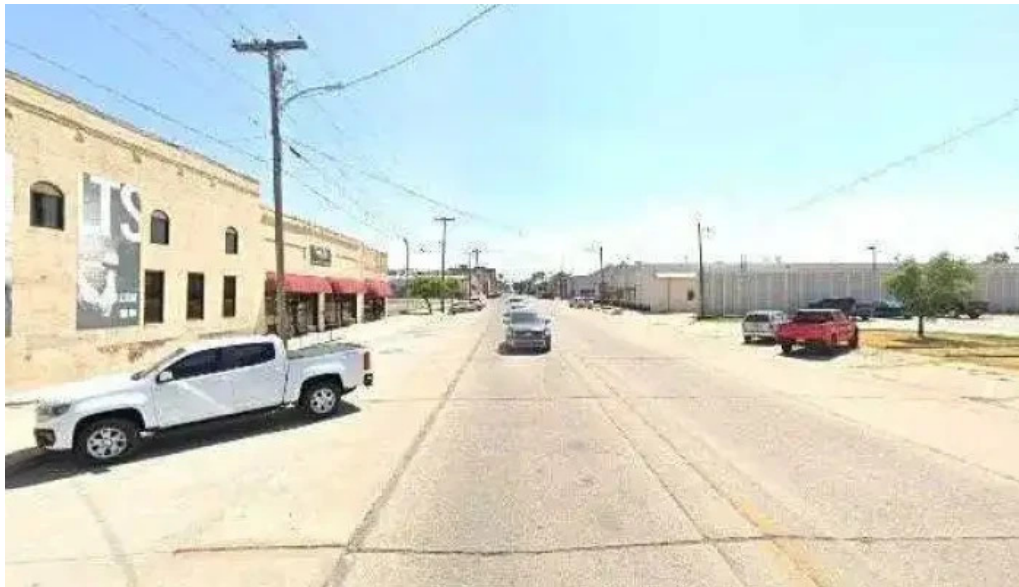
Gym210 street view 360deg