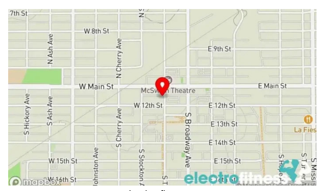
Legion fitness map