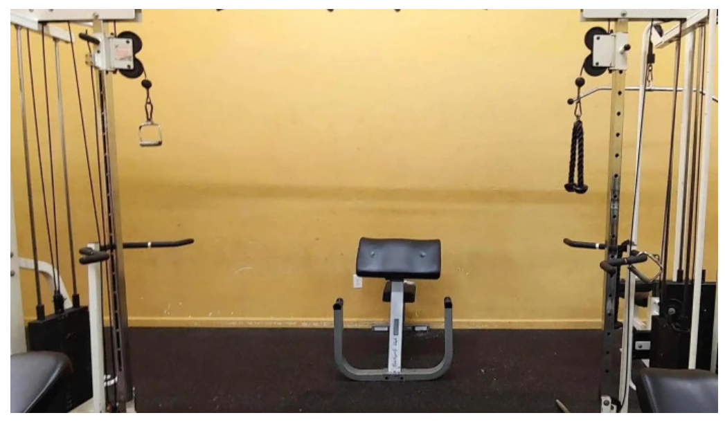
Legion fitness schedule