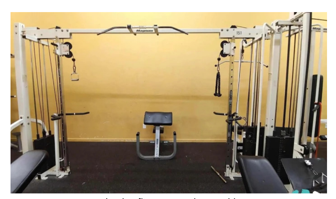
Legion fitness exercise machine