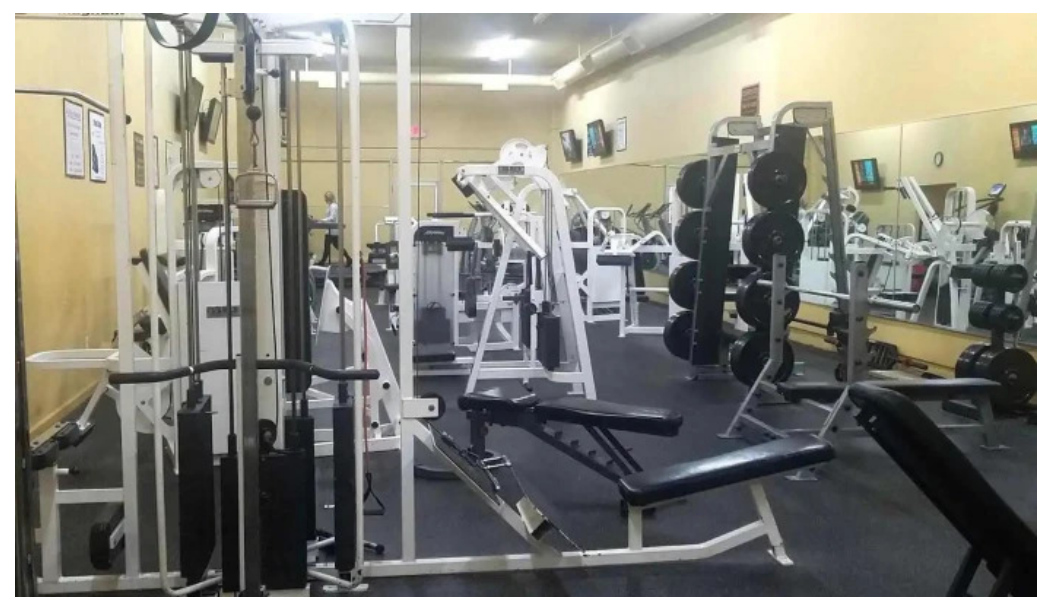
Legion fitness all