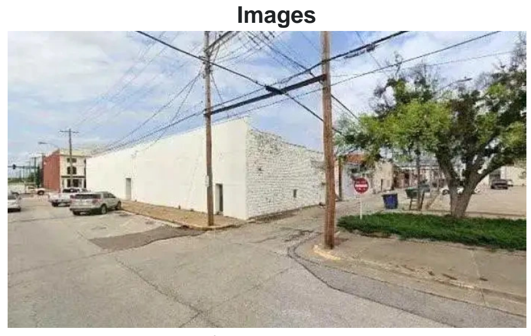
Legion fitness street view 360deg

If you need to update any element that you believe is not correct about this site, we kindly request deliver a message so that we will handle it at the earliest convenience. Thank you in advance we appreciate it.