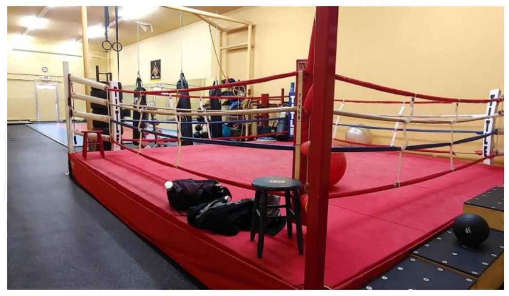
Legion fitness gym