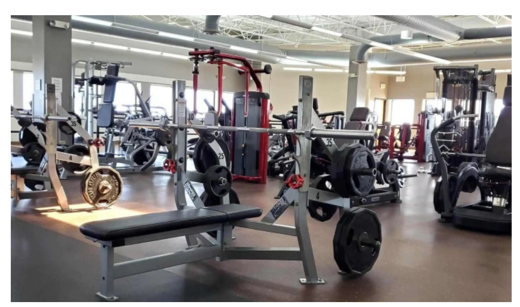
Addison park district club fitness addison