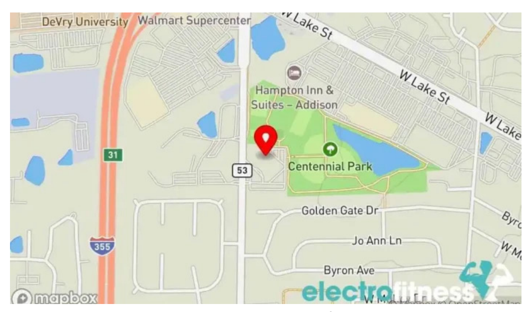
Addison park district club fitness map