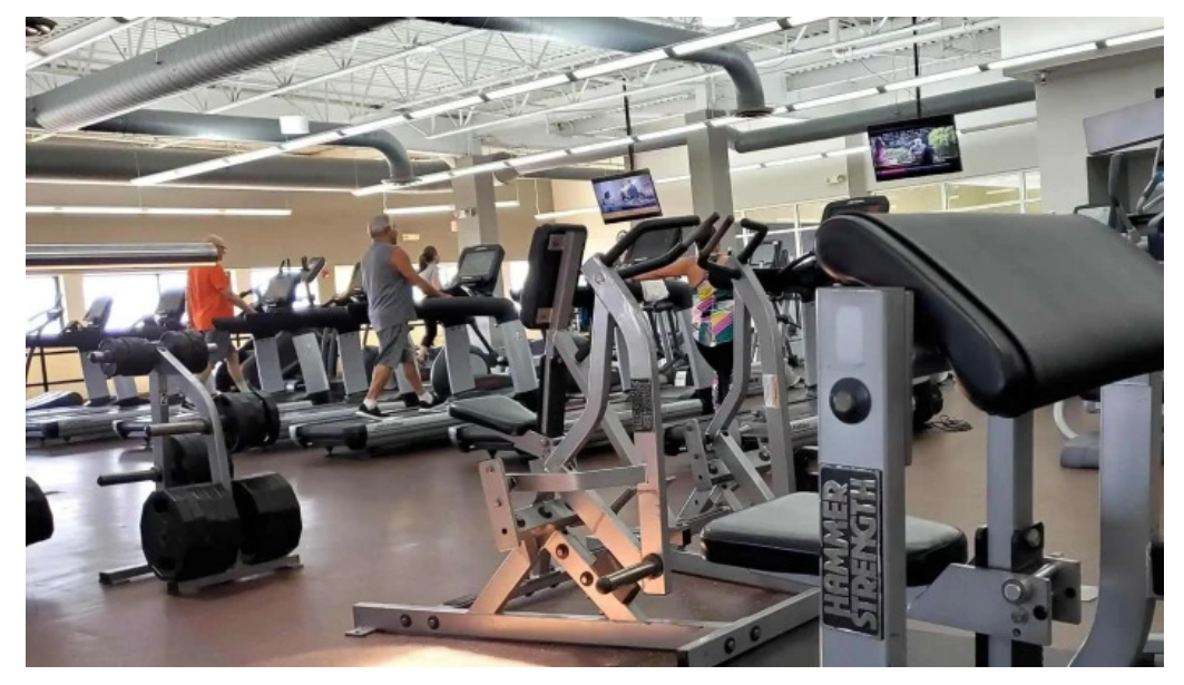
Addison park district club fitness schedule