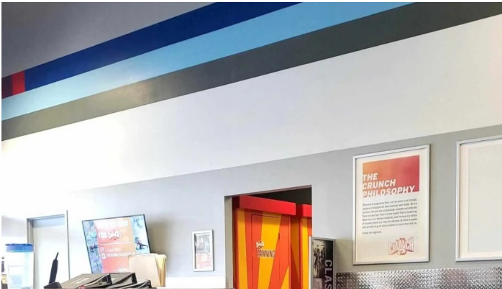
Crunch fitness addison prices