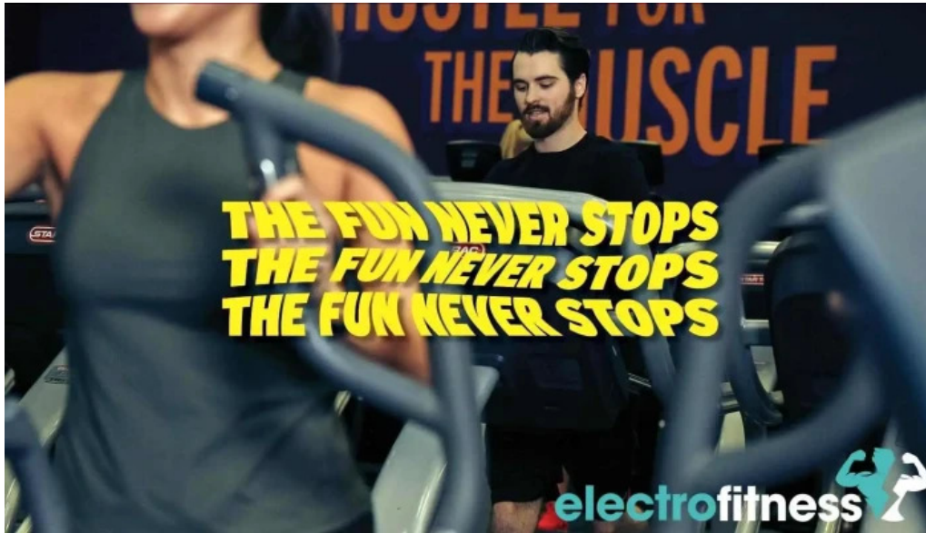
Crunch fitness addison addison