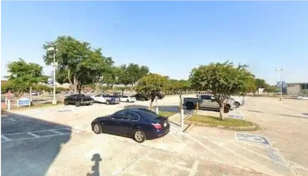
Crunch fitness addison street view 360deg