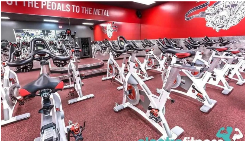
Crunch fitness addison exercise machine