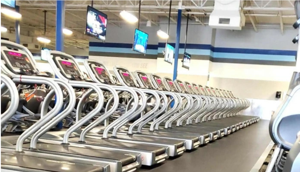
Crunch fitness addison gym