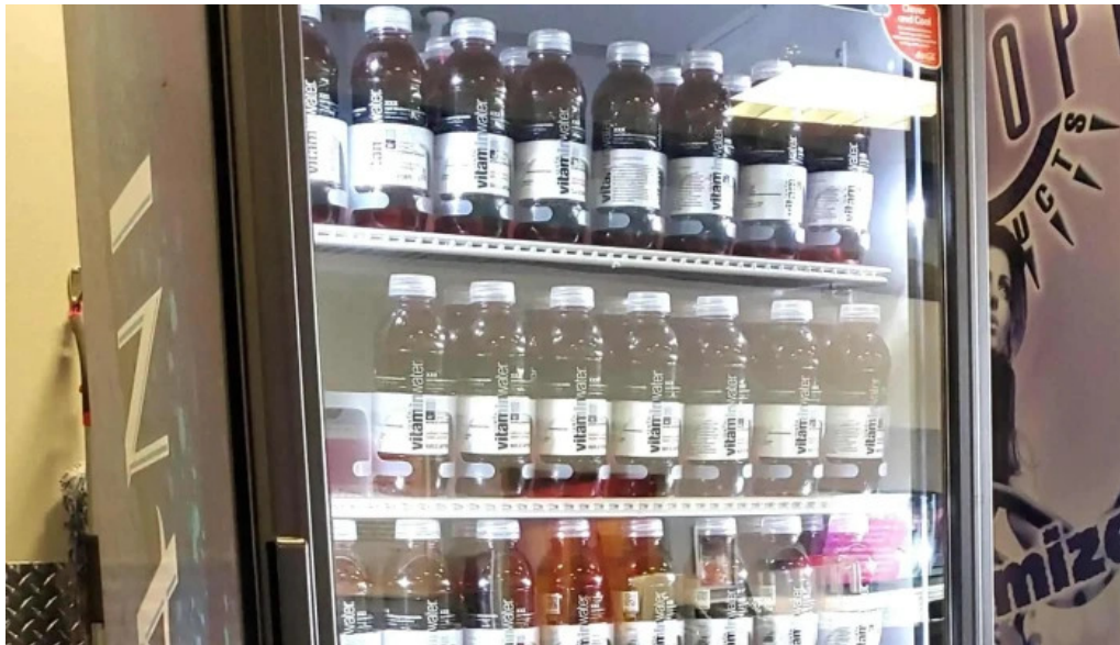
Crunch fitness addison area