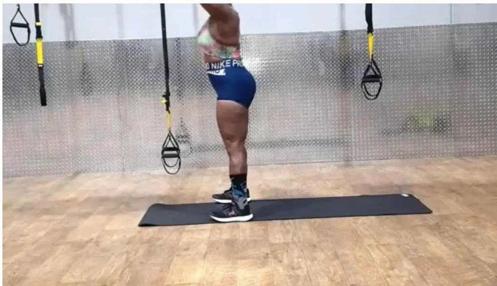
Crunch fitness addison videos