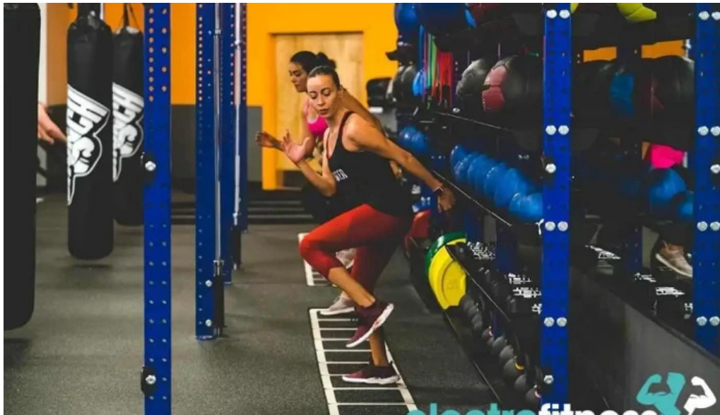
Crunch fitness addison by owner