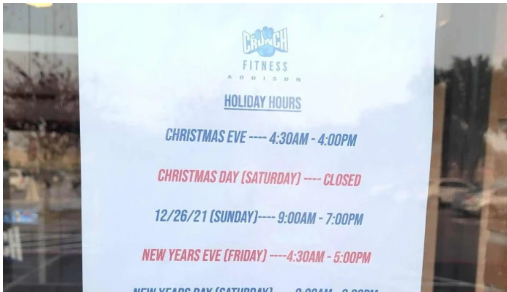
Crunch fitness addison comments