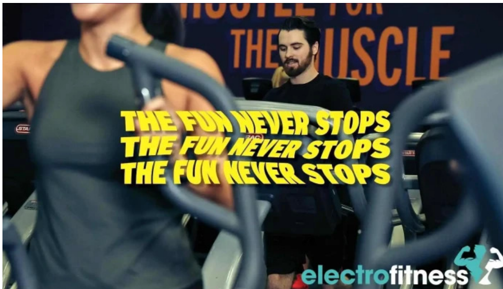
Crunch fitness addison all