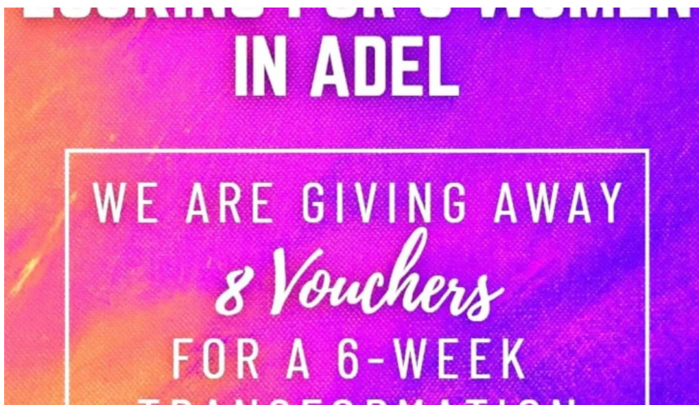
Anytime fitness adel iowa adel