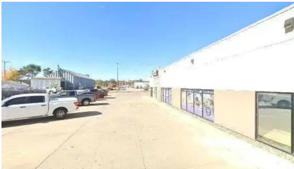
Anytime fitness adel iowa street view 360deg