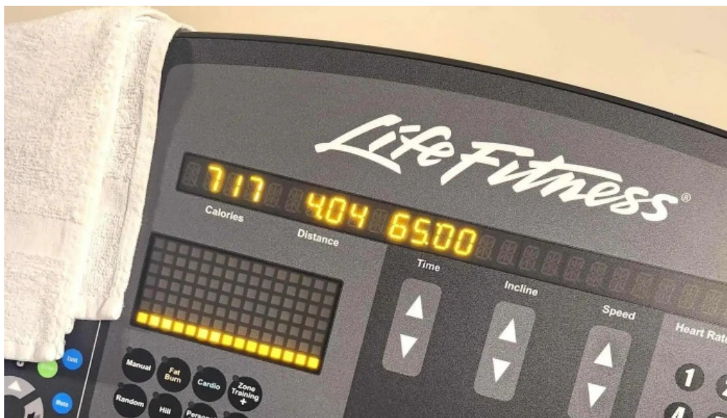
Anytime fitness adel iowa how to get there