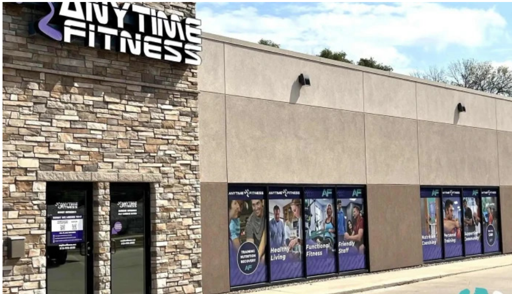
Anytime fitness adel iowa by owner