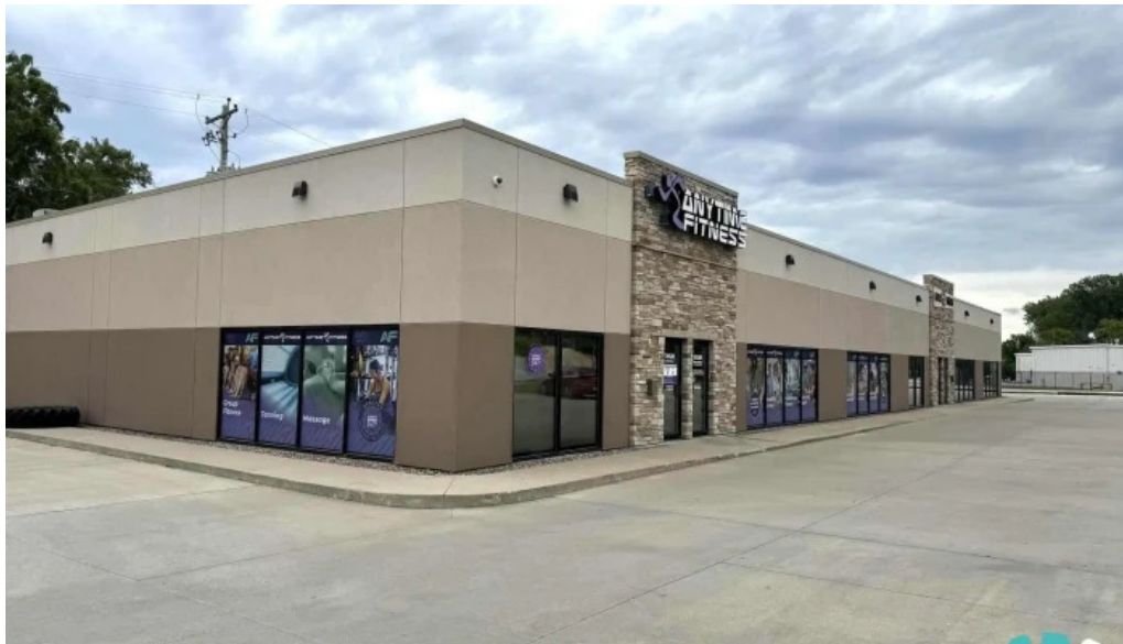
Anytime fitness adel iowa all