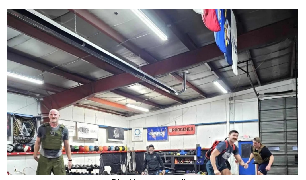
Blackhorse crossfit gym