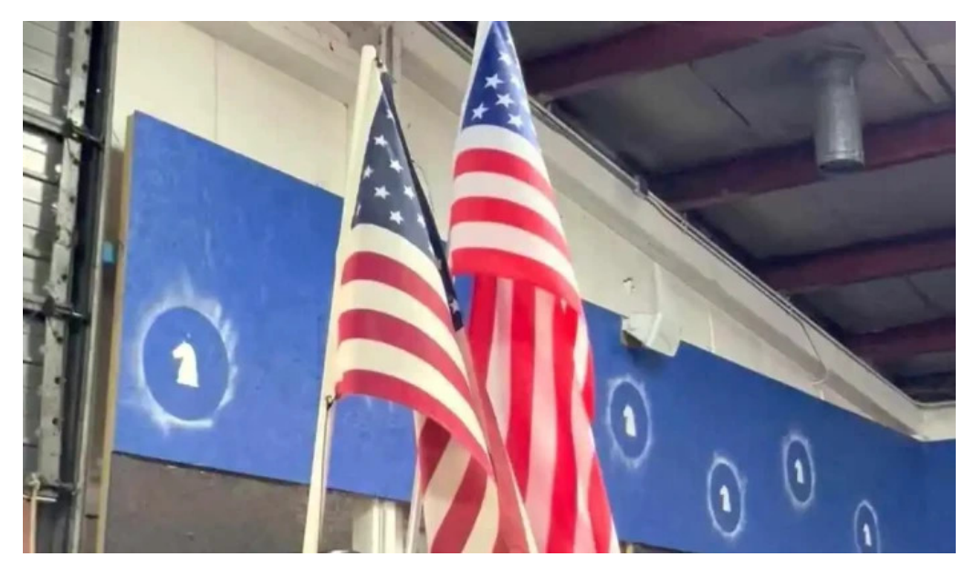
Blackhorse crossfit videos