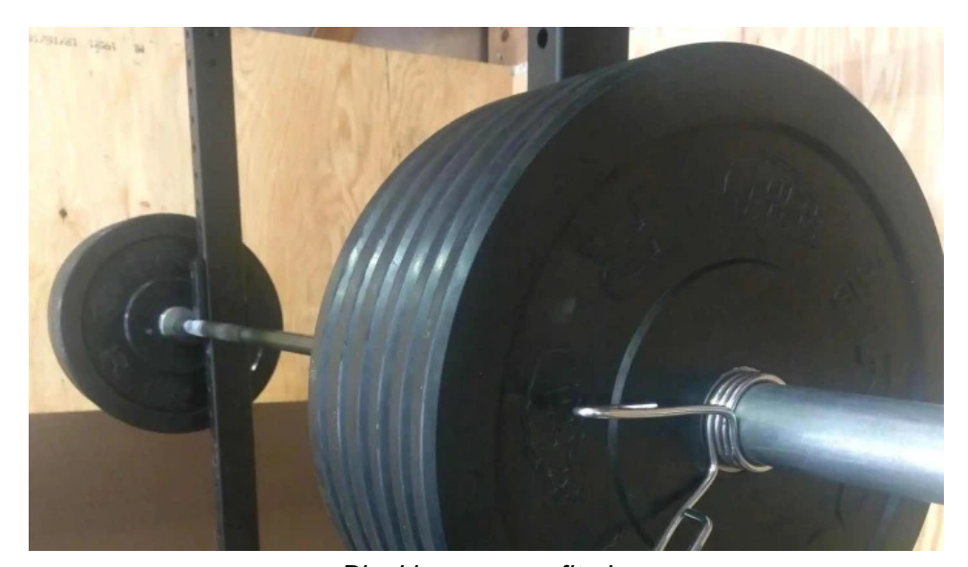
Blackhorse crossfit phone