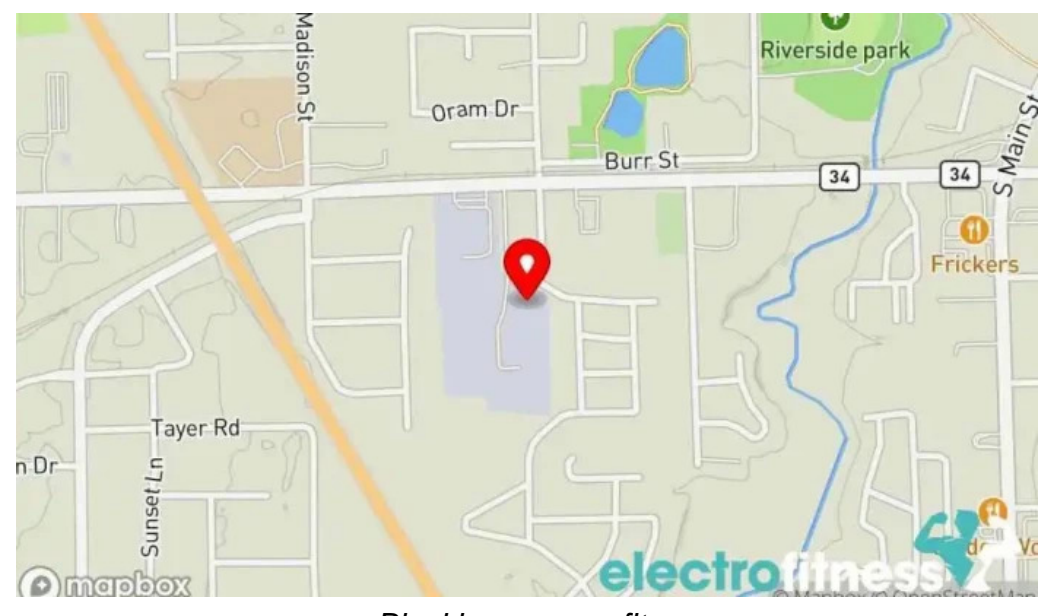
Blackhorse crossfit map