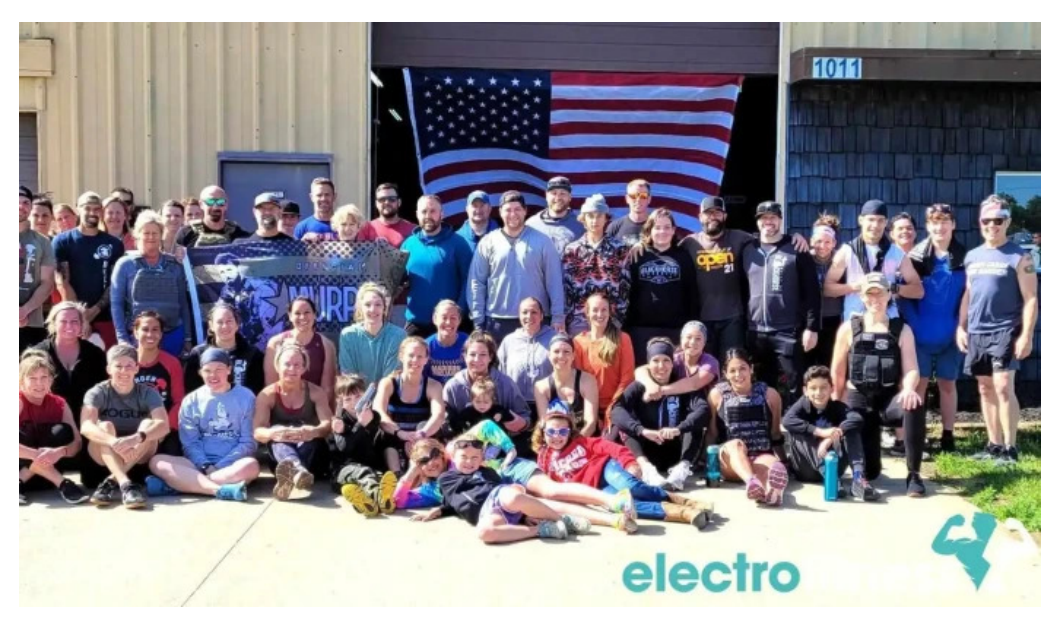
Blackhorse crossfit all