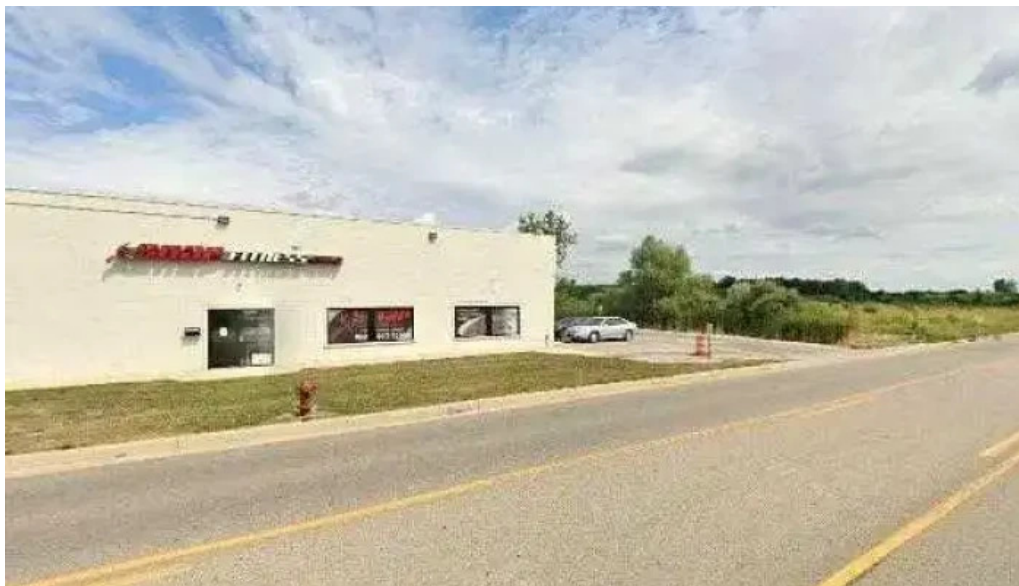
Snap fitness alma street view 360deg