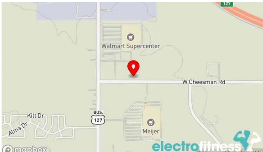
Snap fitness alma map