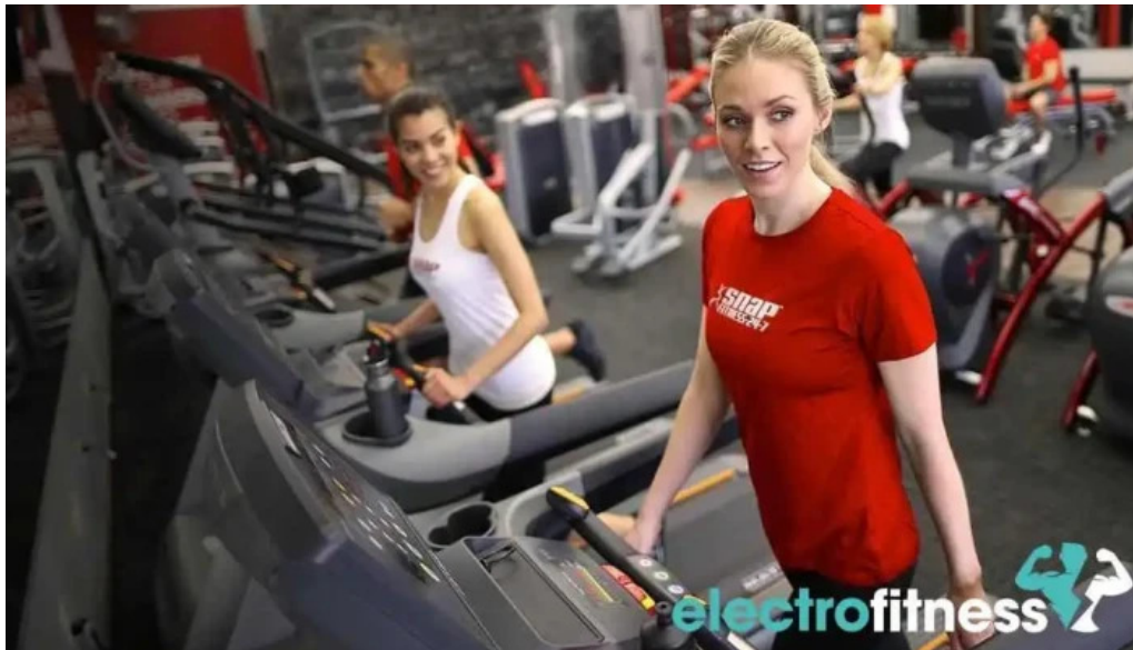
Snap fitness alma all