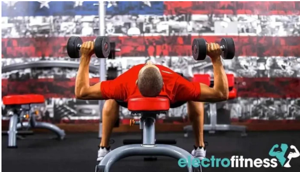
Snap fitness alma by owner