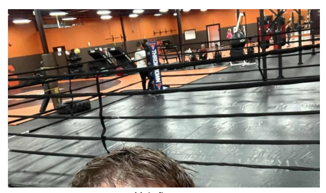
Mule fitness gym