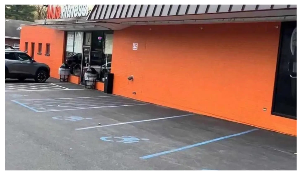
Mule fitness videos