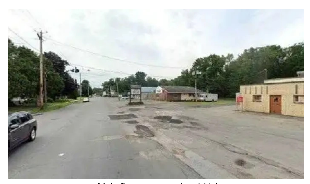
Mule fitness street view 360deg