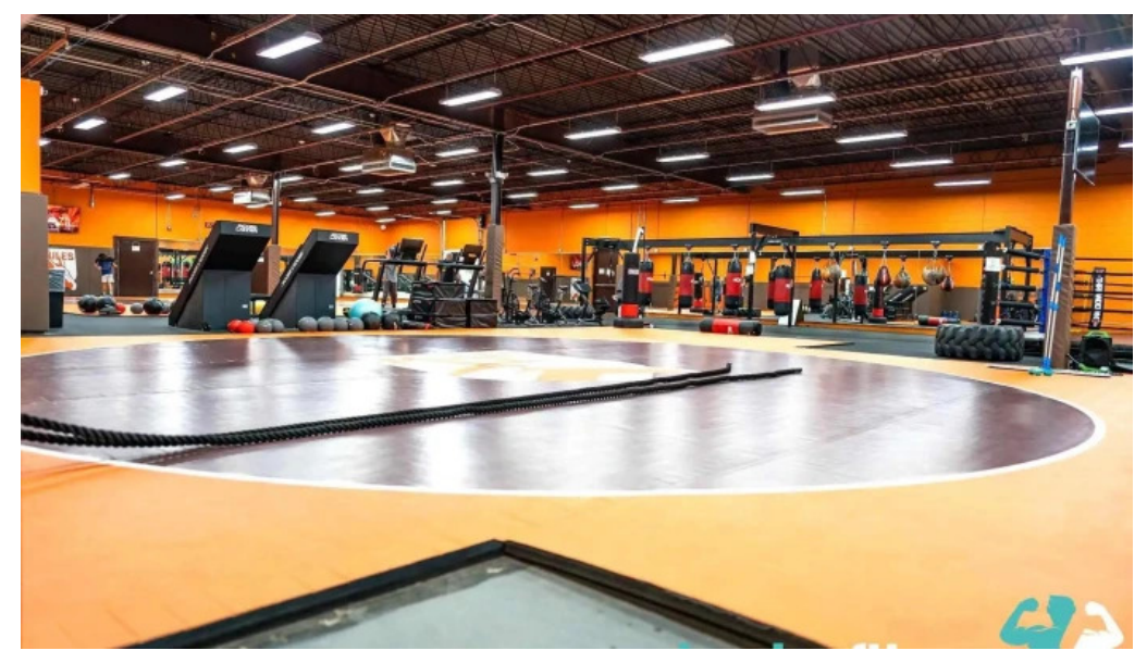
Mule fitness by owner