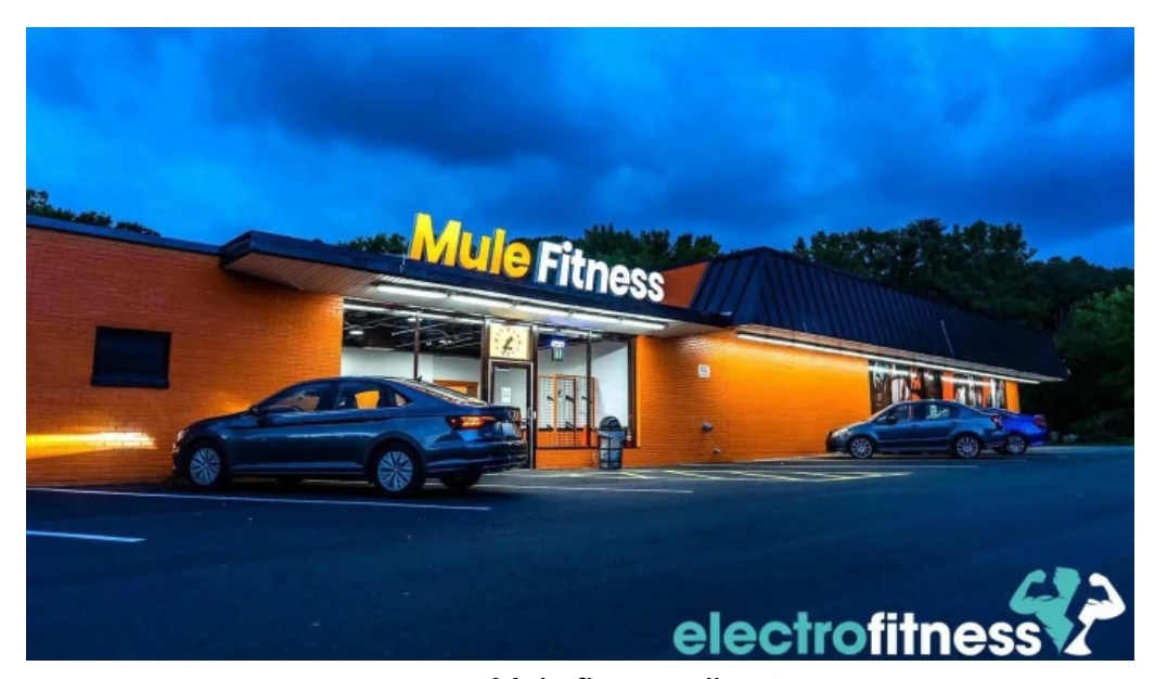
Mule fitness all