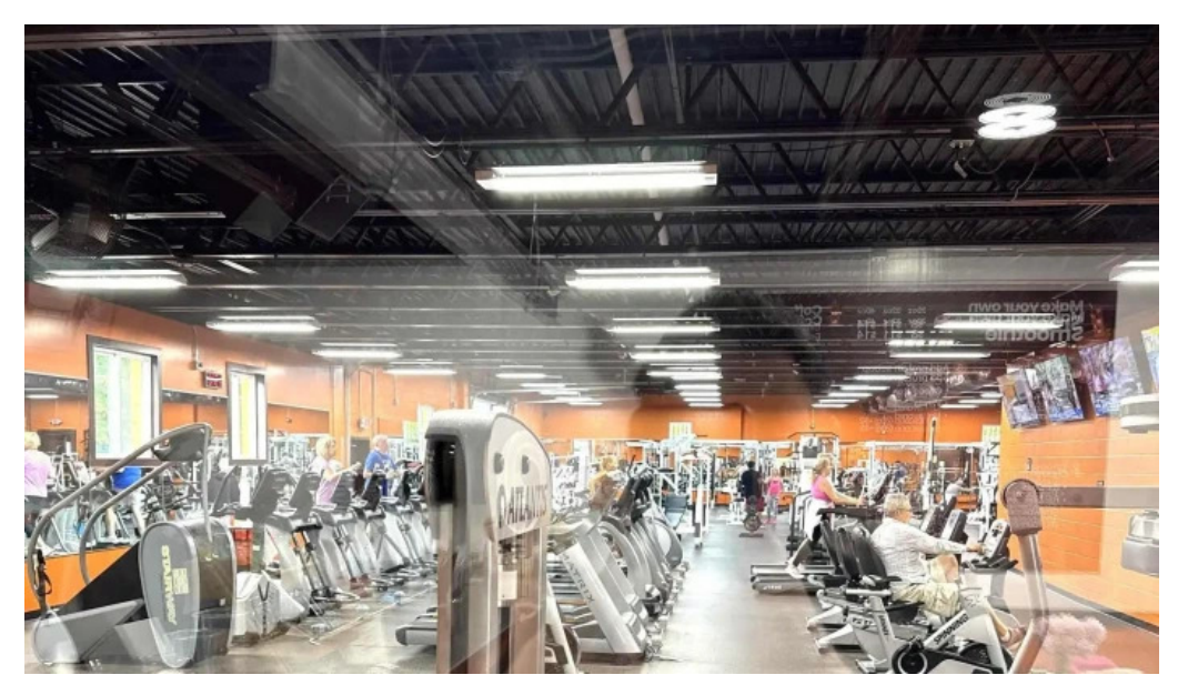
Mule fitness amsterdam