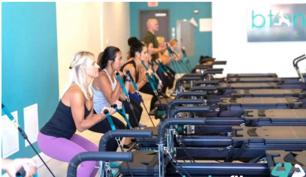
Btone fitness andover andover