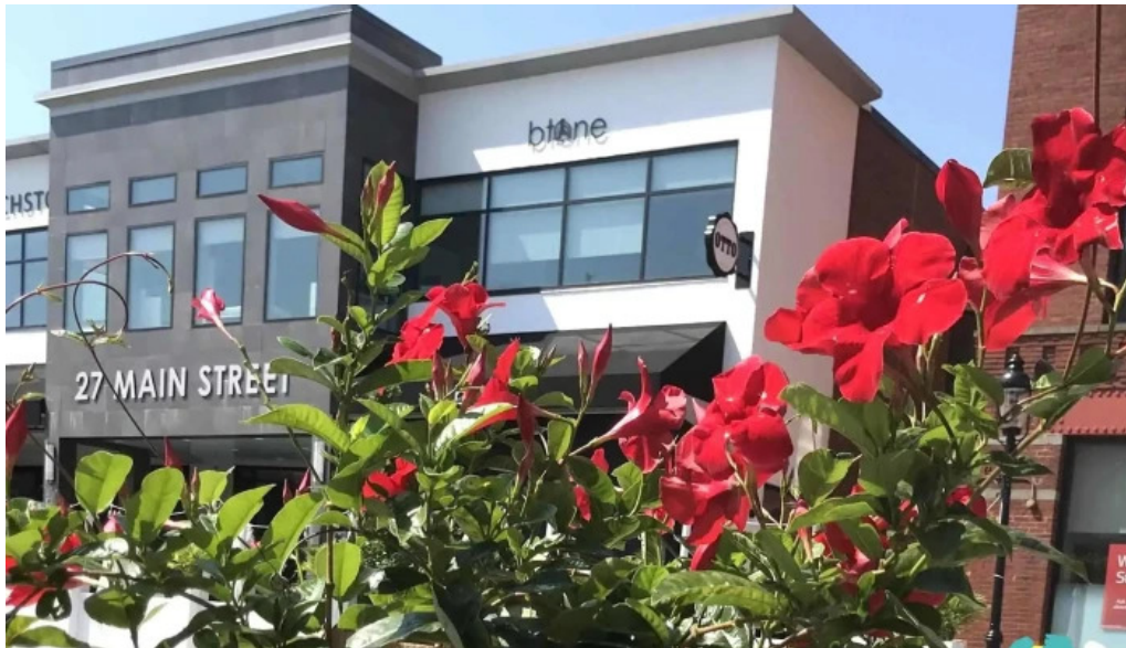
Btone fitness andover by owner