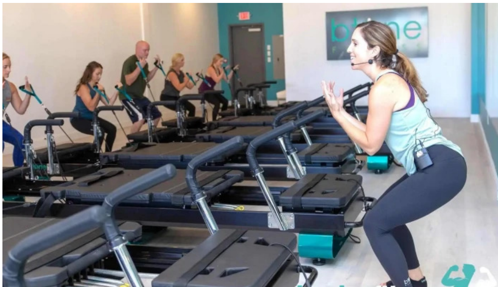
Btone fitness andover gym