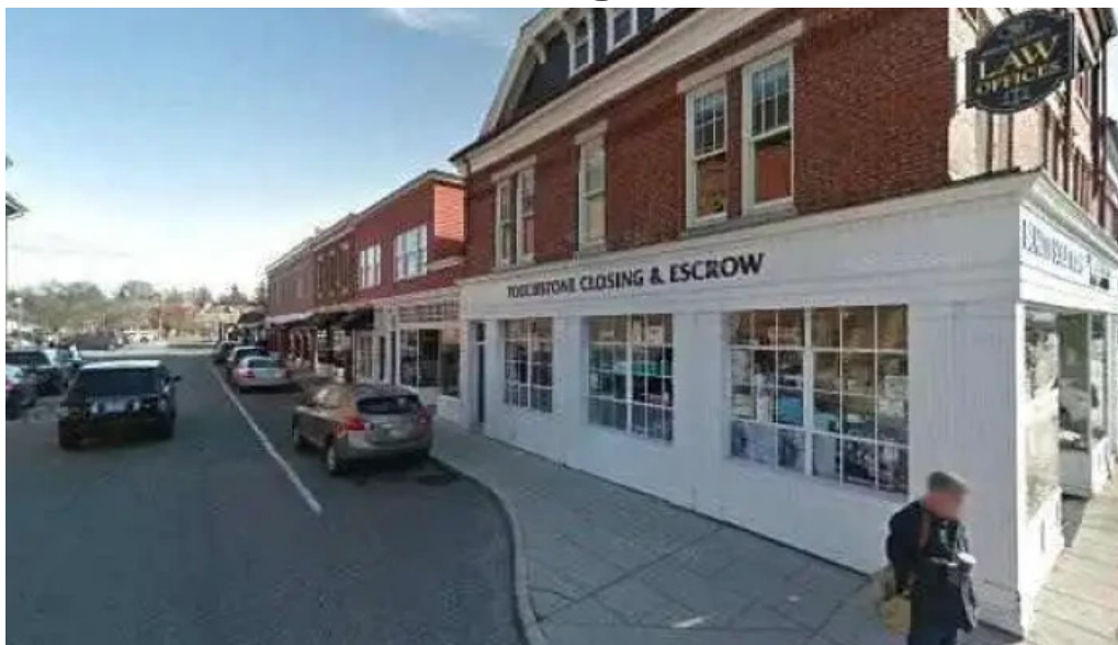
Btone fitness andover street view 360deg