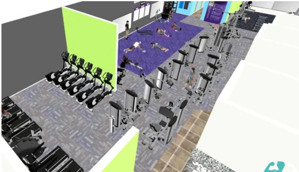
Anytime fitness andrews