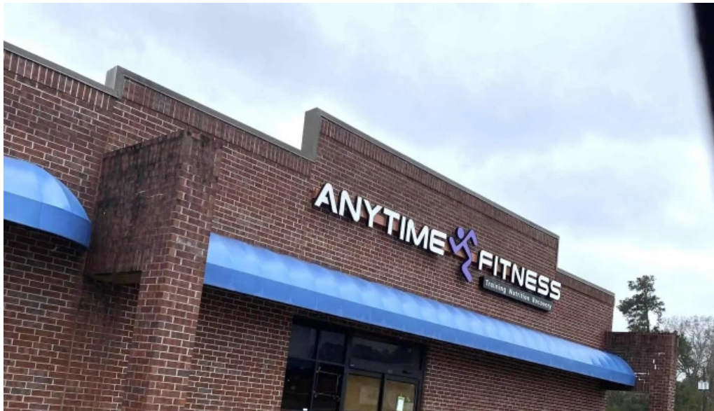
Anytime fitness gym