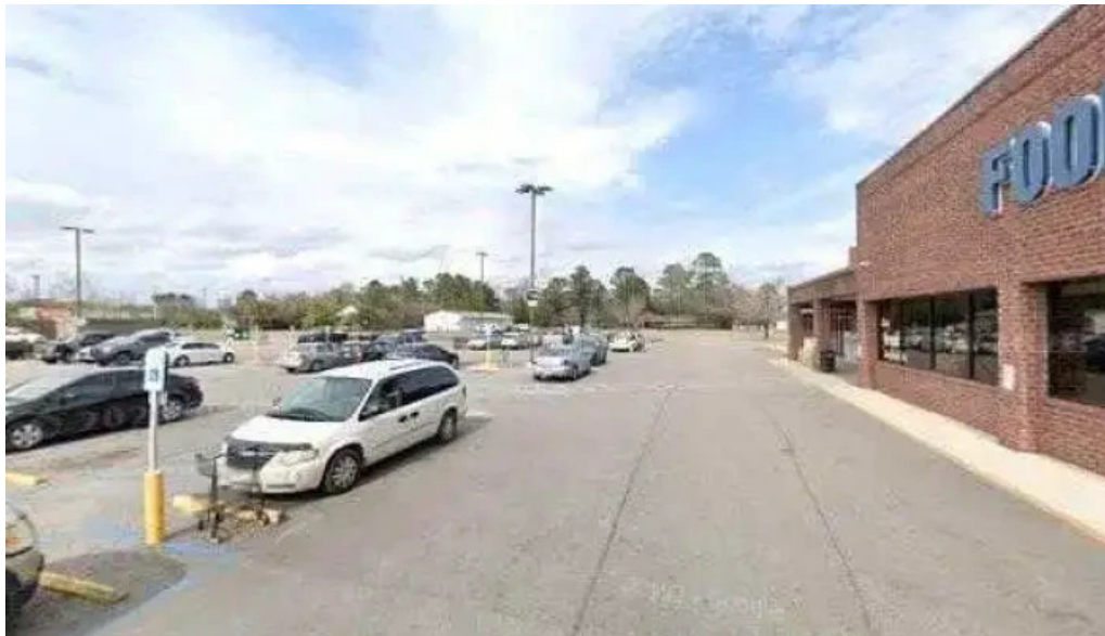
Anytime fitness street view 360deg