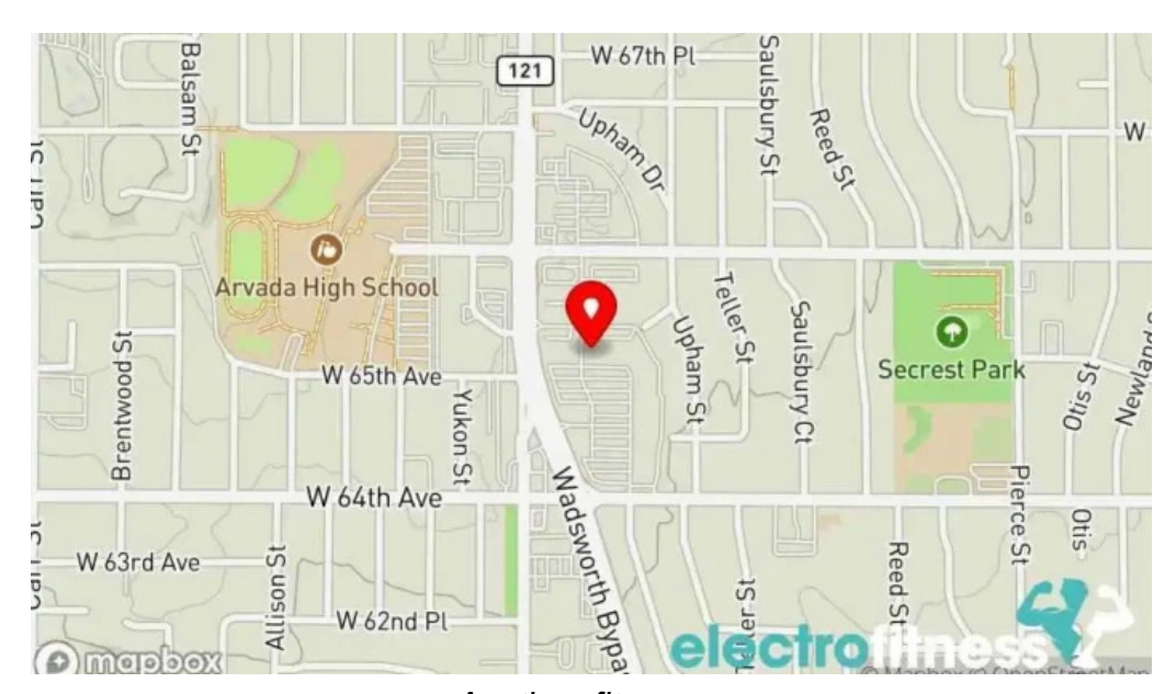
Anytime fitness map