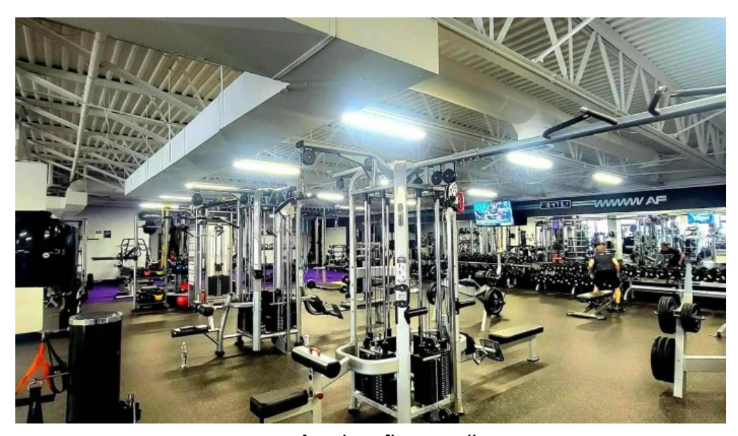
Anytime fitness all