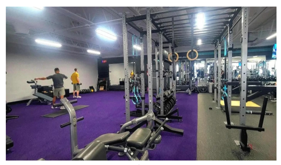
Anytime fitness arvada