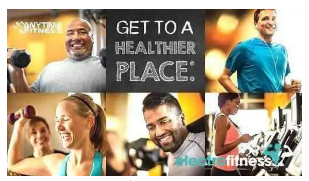
Anytime fitness exercise machine