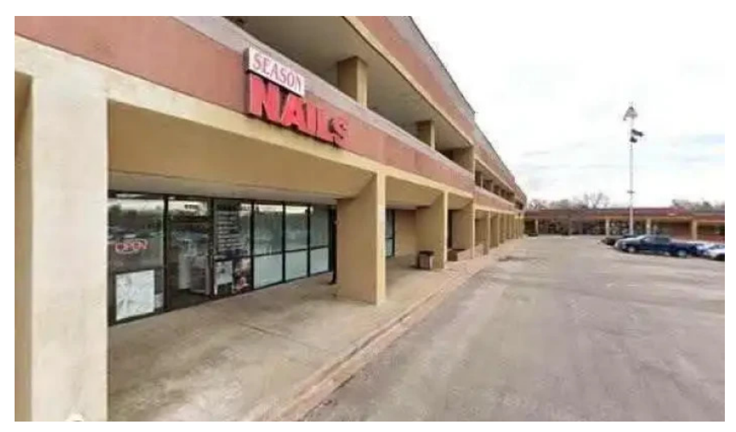
Anytime fitness street view 360deg