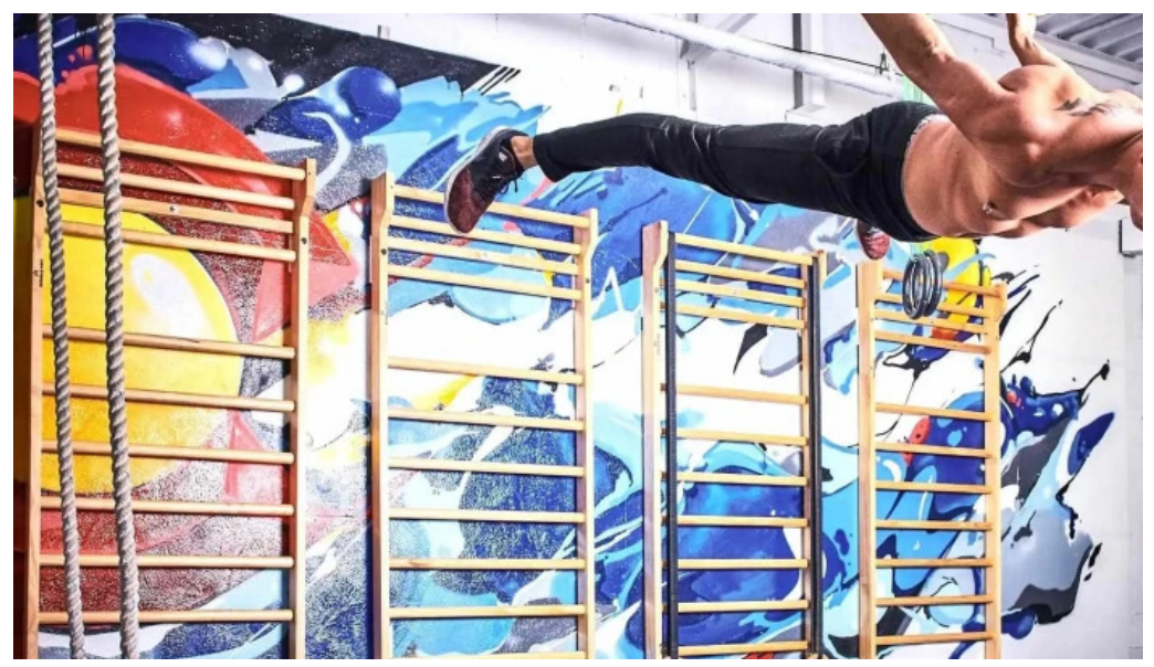
Commit2fitness how to get there