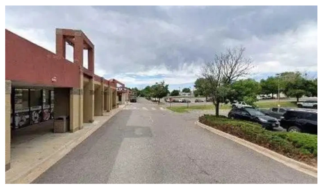
Commit2fitness street view 360deg