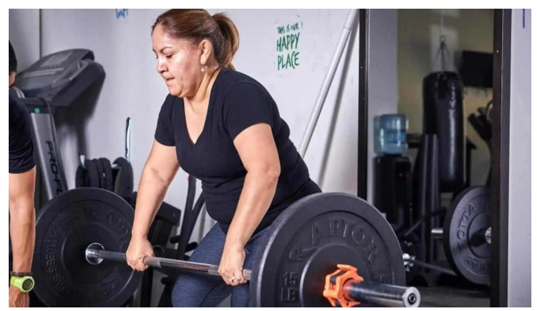
Commit2fitness open now