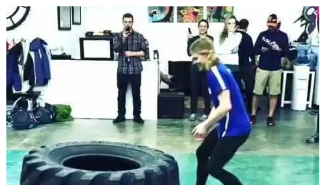
Commit2fitness by owner