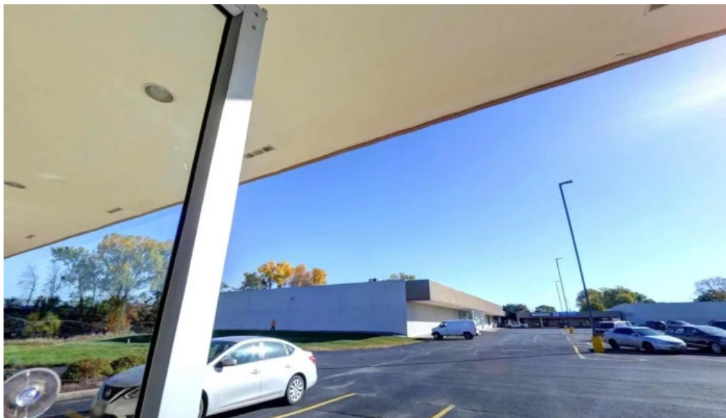
Anytime fitness street view 360deg