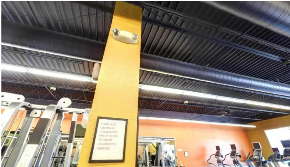
Anytime fitness gym