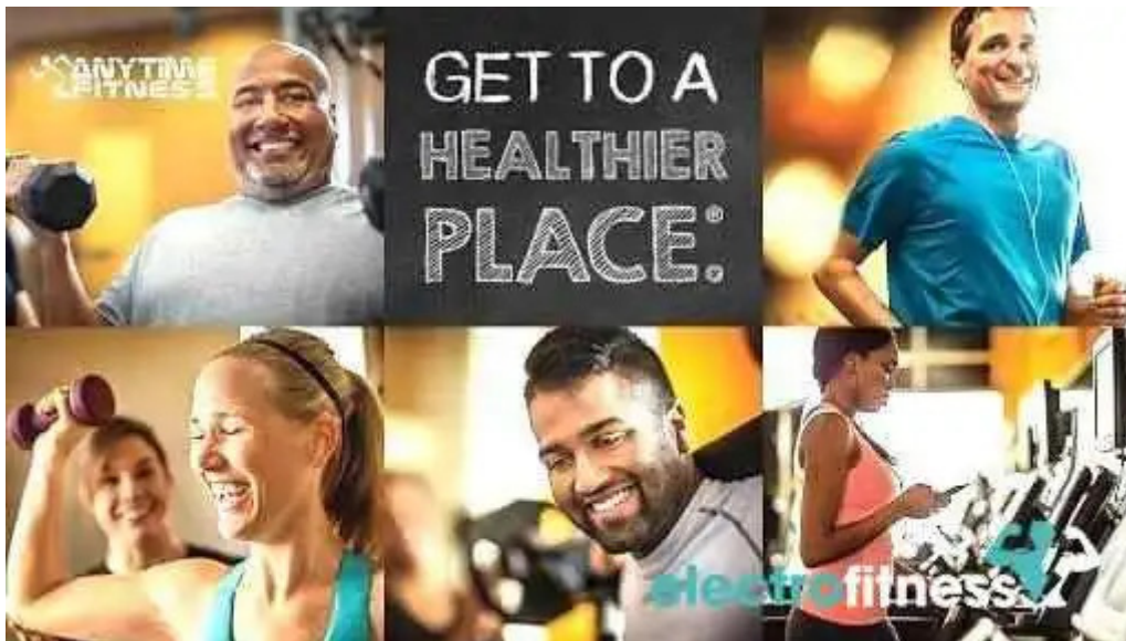
Anytime fitness by owner