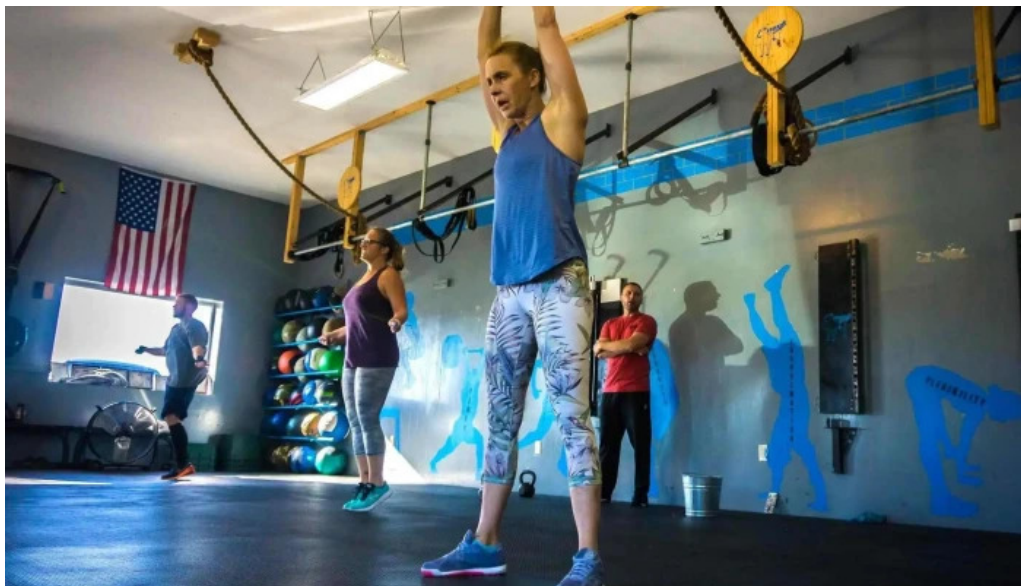
The lodge strength training conditioning gym