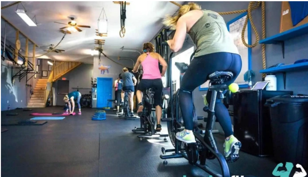
The lodge strength training conditioning bloomsburg