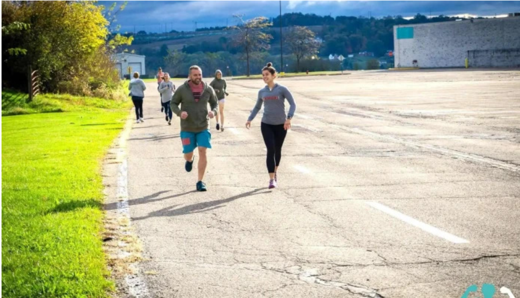
The lodge strength training conditioning by owner