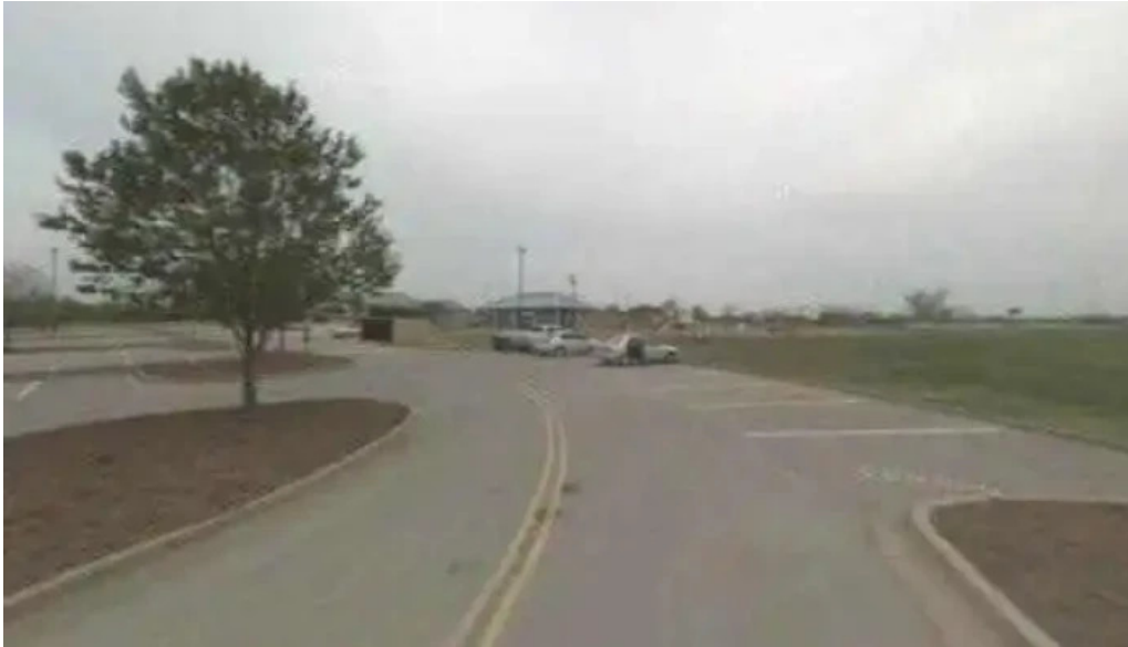
Bowling green parks and rec outdoor fitness zone street view 360deg