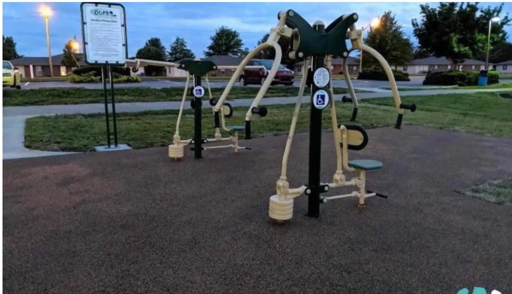
Bowling green parks and rec outdoor fitness zone bowling green