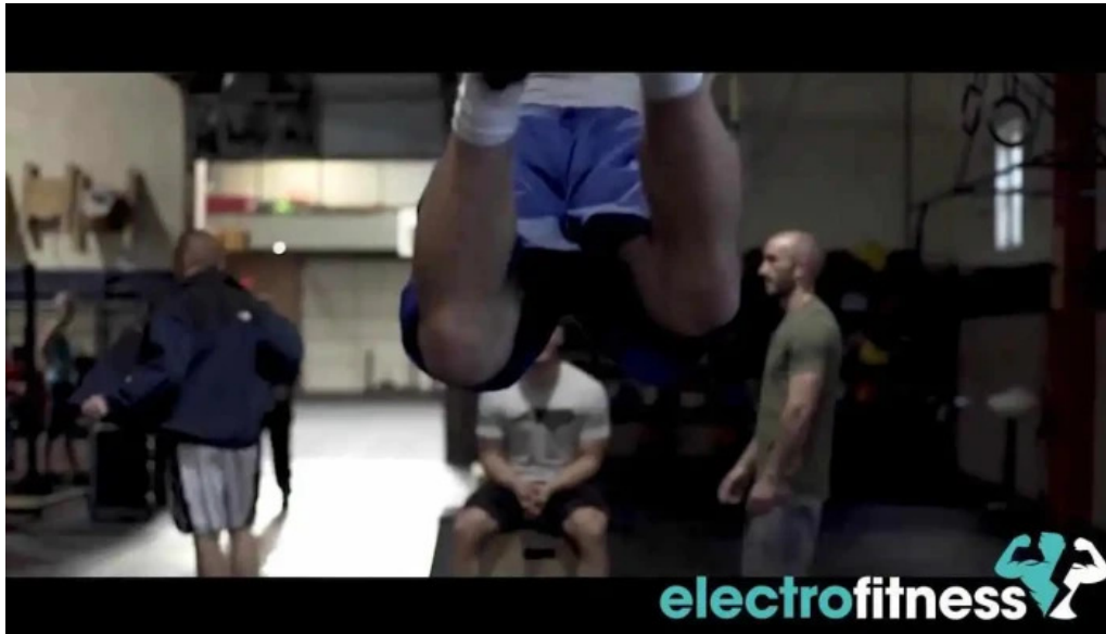
Cross fit old school videos