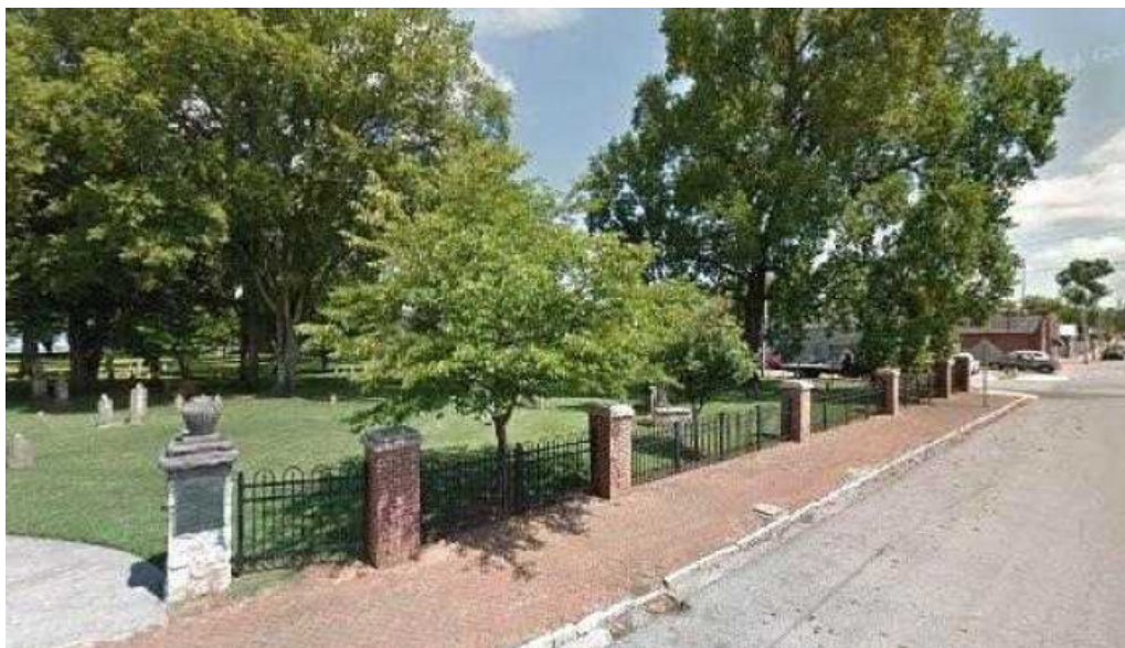
Cross fit old school street view 360deg