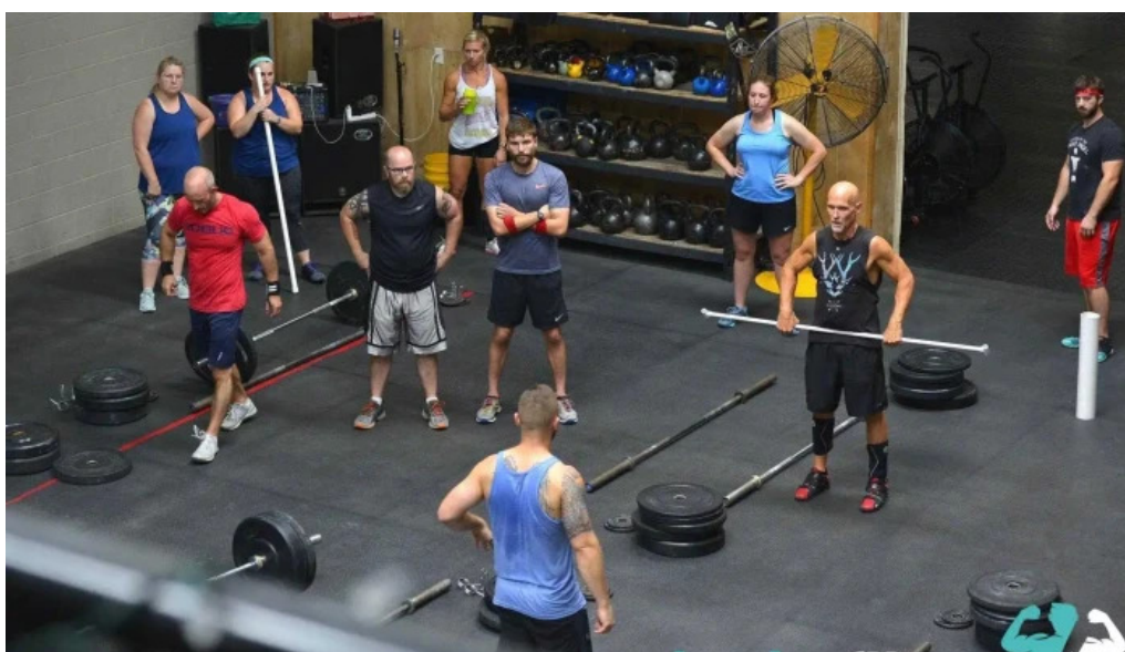
Cross fit old school all