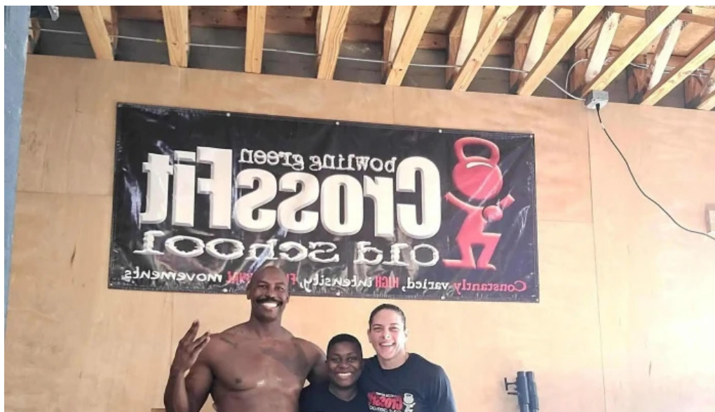
Cross fit old school gym