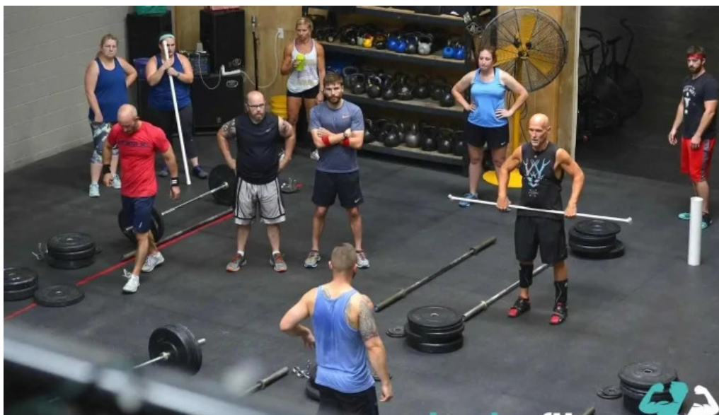
Cross fit old school bowling green