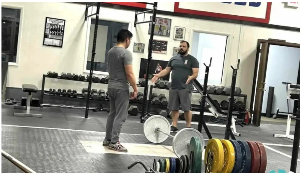
Pittsburgh barbell club bridgeville