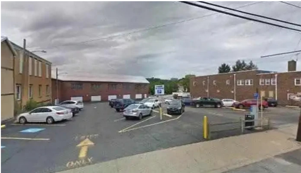
Pittsburgh barbell club street view 360deg