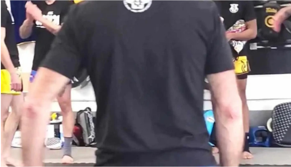
Pittsburgh barbell club videos