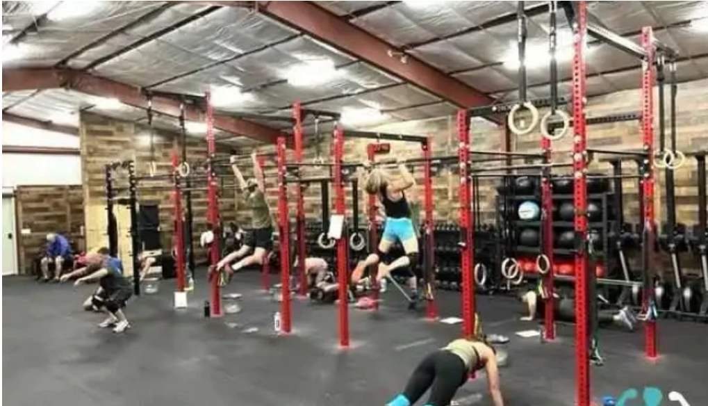
Reach4it crossfit gym