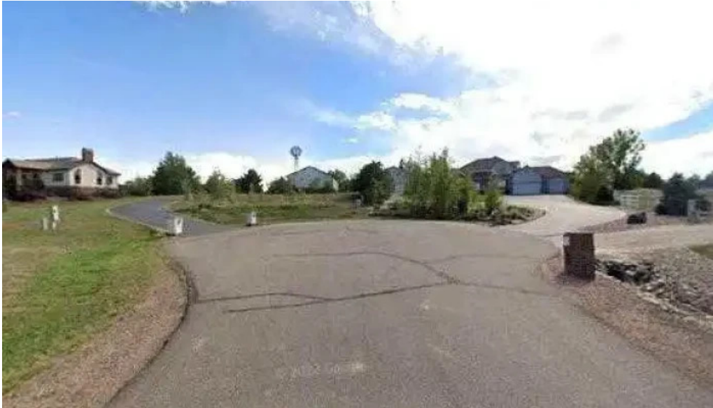
Reach4it crossfit street view 360deg