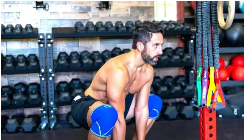
Reach4it crossfit by owner