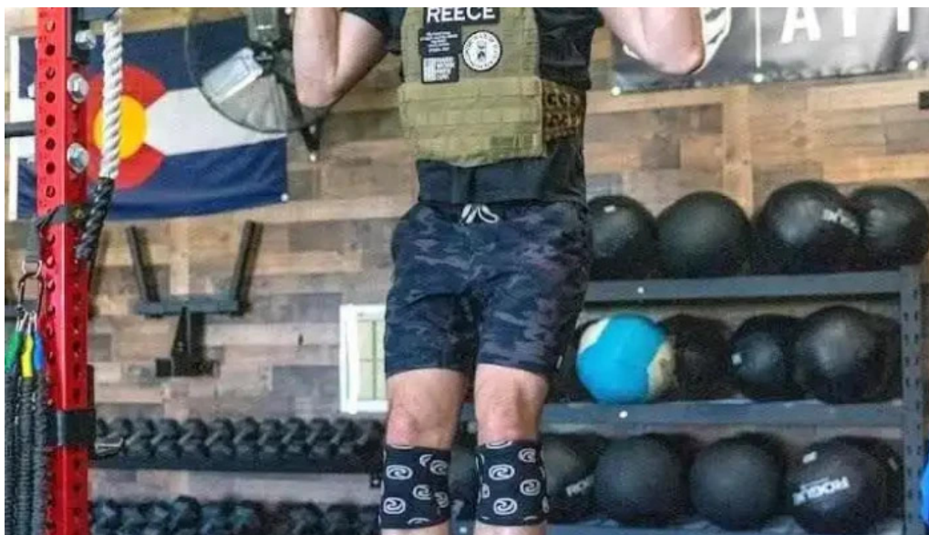
Reach4it crossfit broomfield